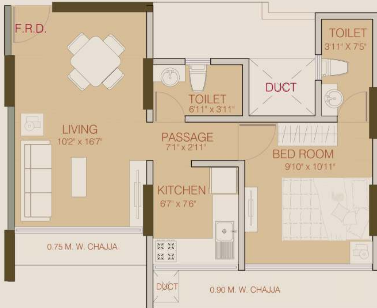
UNIT PLAN - FLAT NO. 1