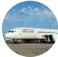
T2 International Airport 3.5 Kms.