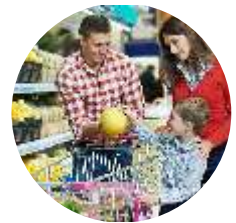
Theaters and shopping center Nearby