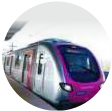
J B Nagar metro station 0.5 kms