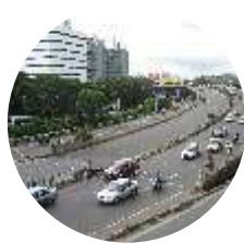
Western Express Highway 4.5 Kms