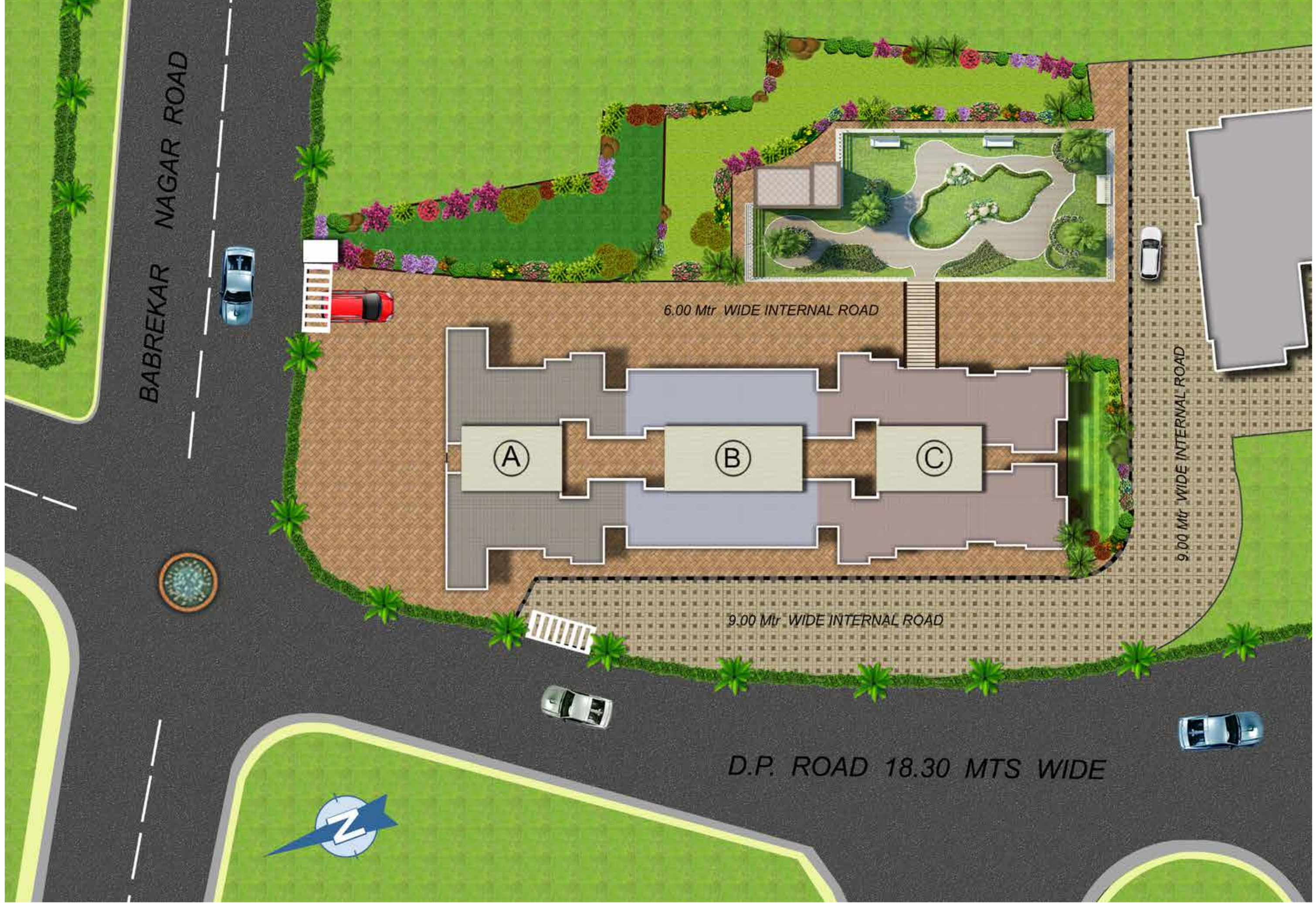
Plot Layout Plan