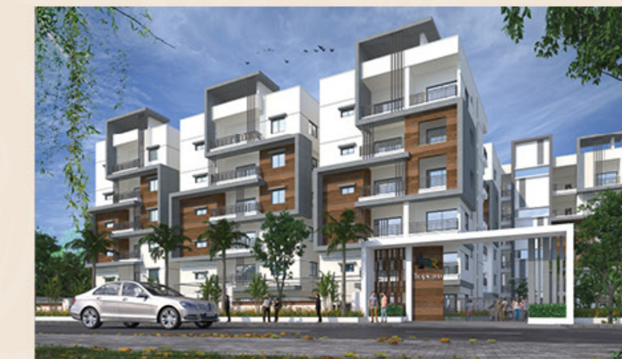
RR TROPICANA @ Narsingi