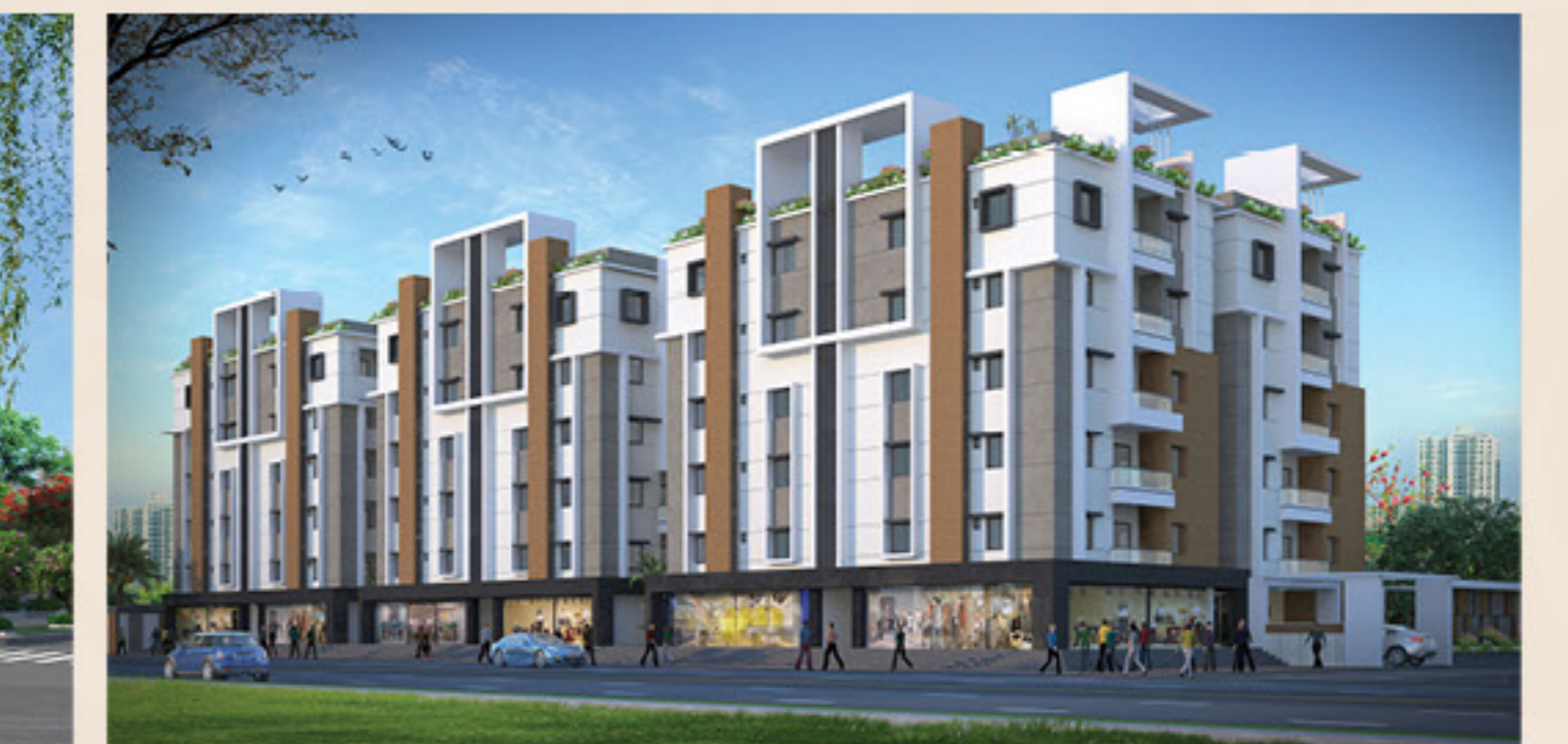
RR CENTRAL PARK @ Alkapoor Township