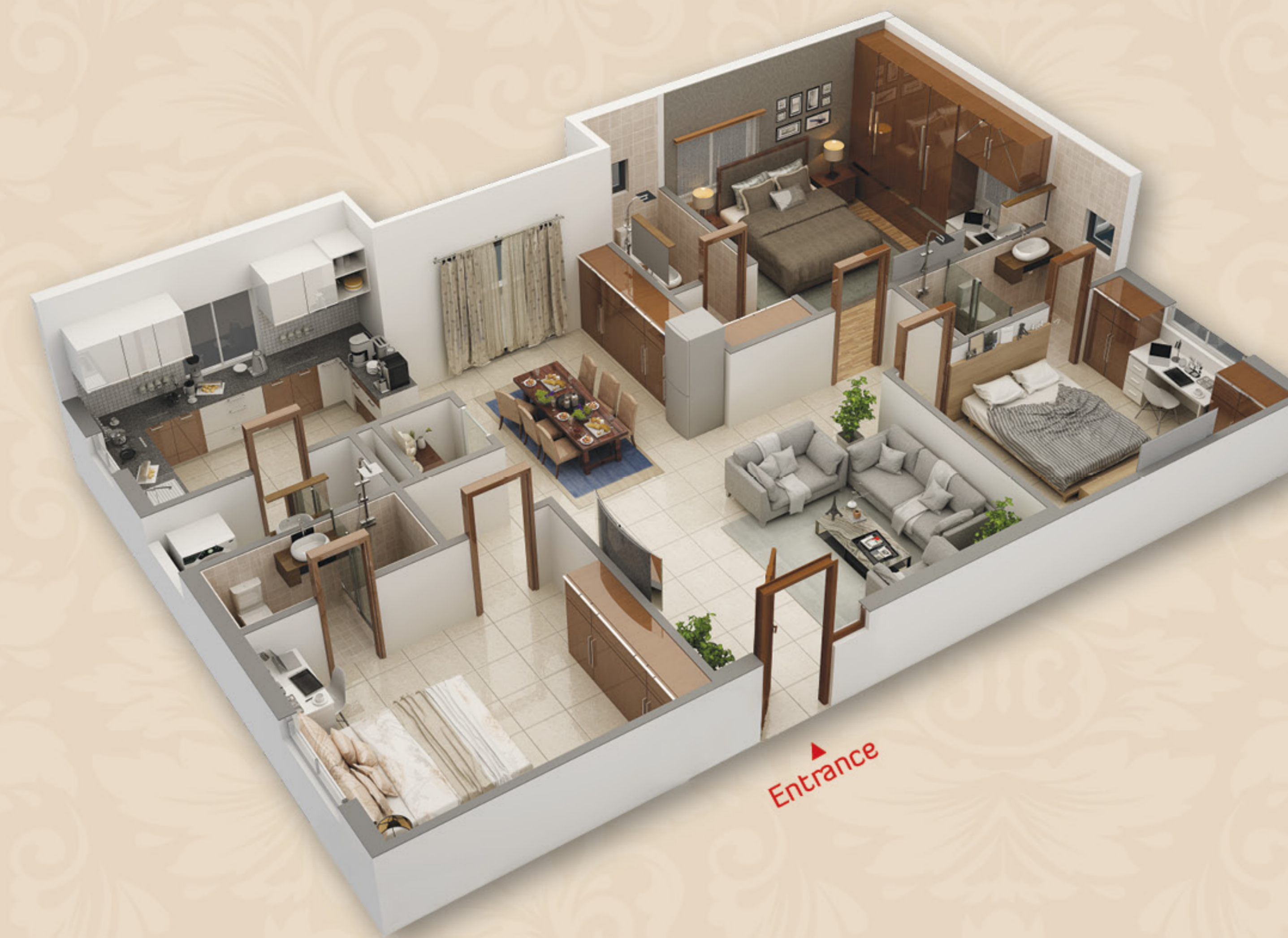
3 BHK | NORTH-FACING 3D VIEW | FLAT - 8