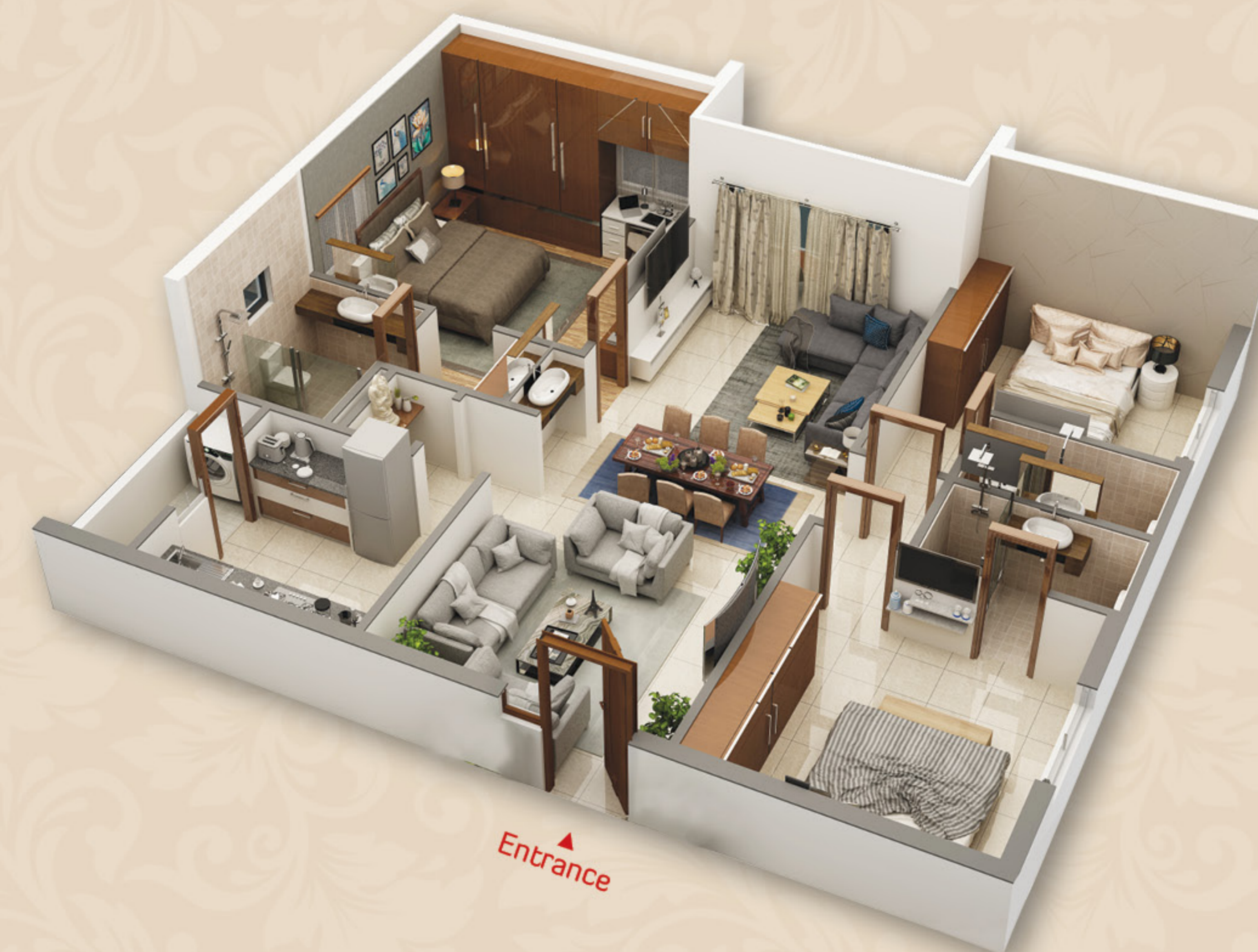
3 BHK | EAST-FACING 3D VIEW | FLAT - 14