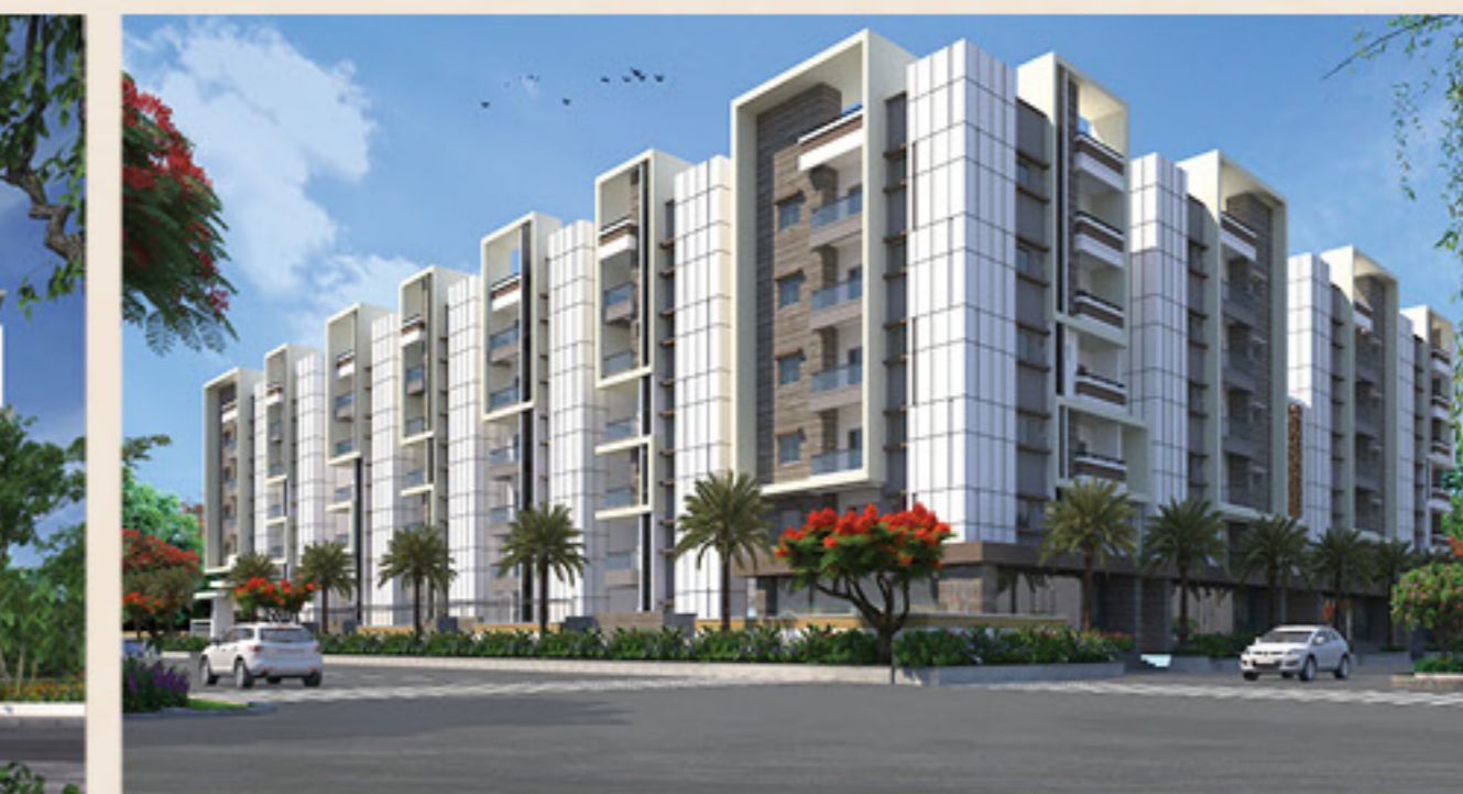
RR VILLAGE POINTE @ Alkapoor Township