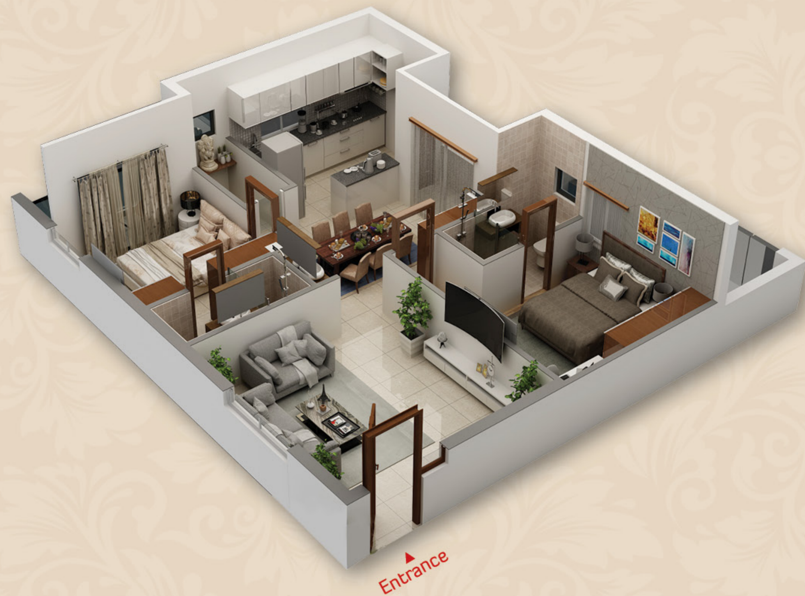
2 BHK | WEST-FACING 3D VIEW | FLAT - 7