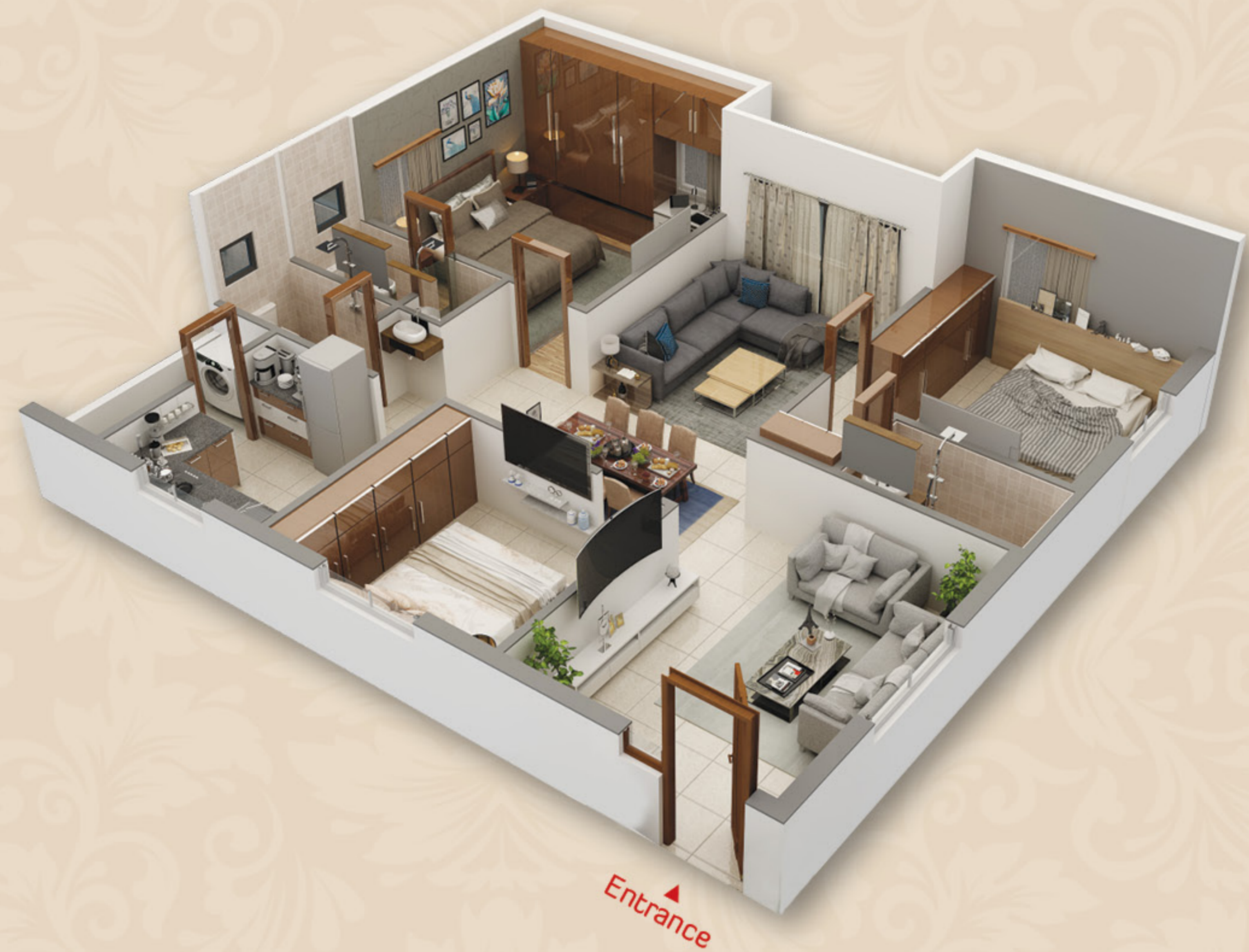
3 BHK | EAST-FACING 3D VIEW | FLAT - 1