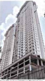
Sunteck's project at Chhatrapati Shivaji Maharaj Vastu Sangrahalaya

How does a developer create the city's next business district? For starters, Mumbai, toughest market in Indian real estate, has little to offer to real estate. There is cut-throat competition for land. Most of all, it requires a common sense to decide on something new or different in a futuristic way for something that might take years to pull off.