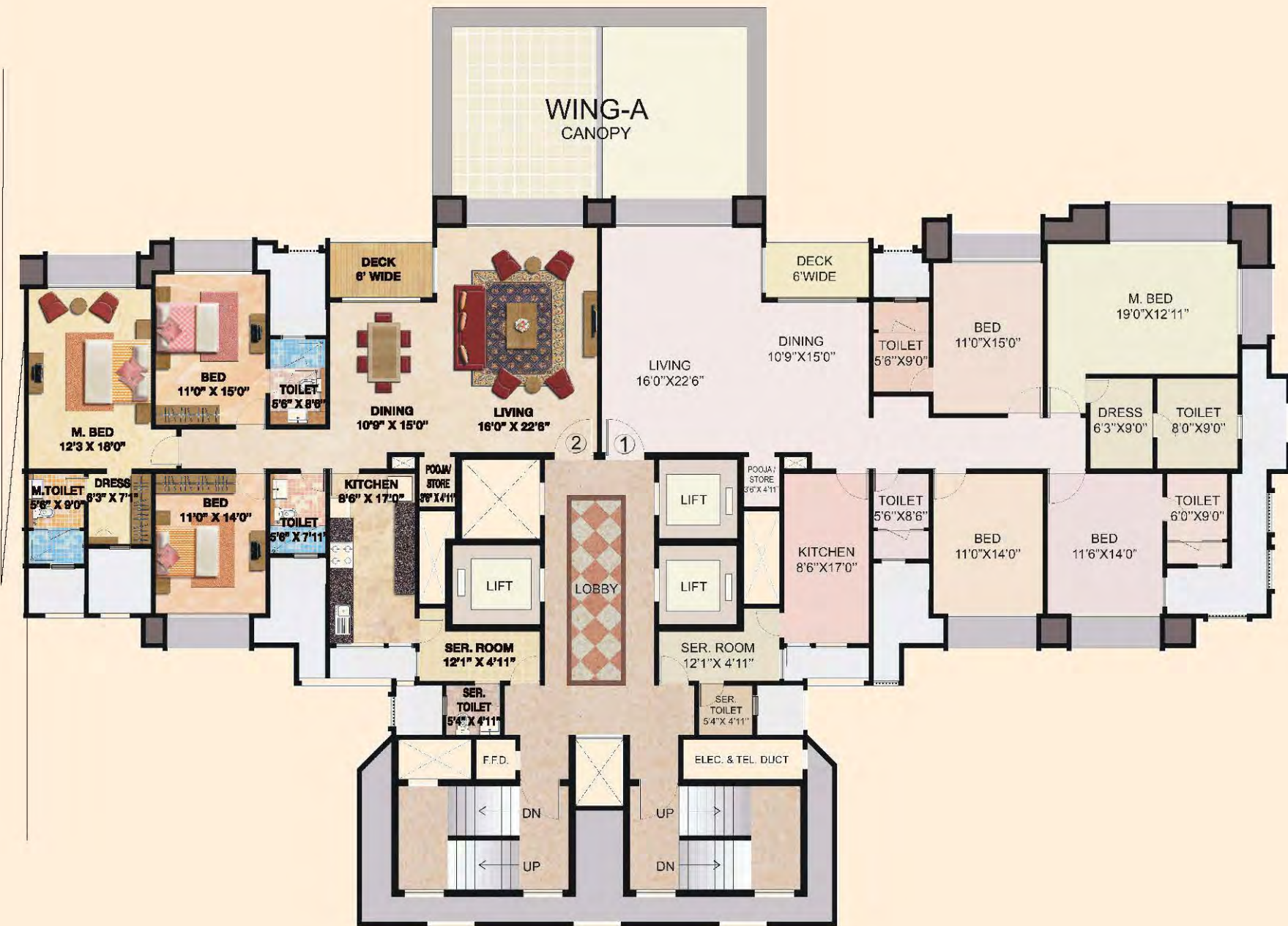
STILT + 28 FLOORS