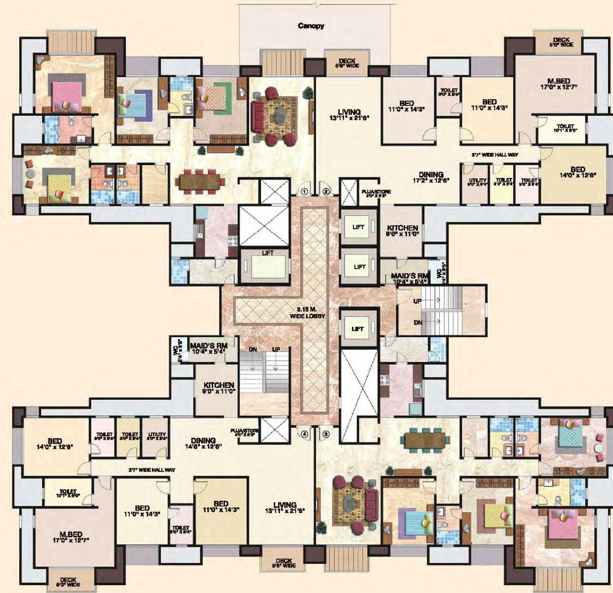
STILT + 28 FLOORS