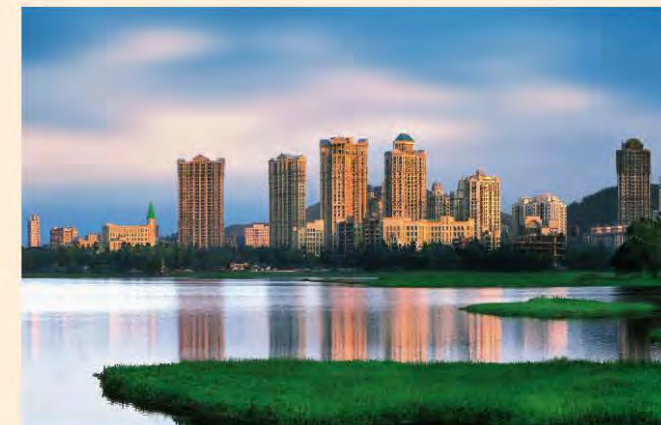
Hiranandani Gardens, Powai