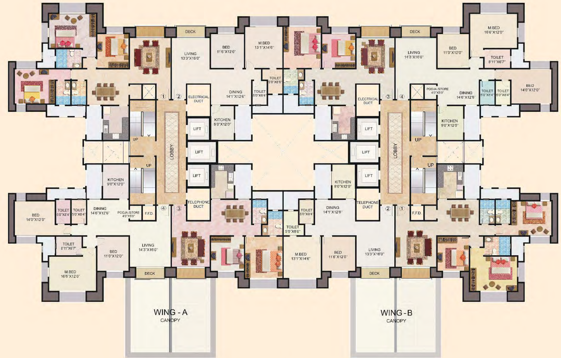
STILT + 28 FLOORS