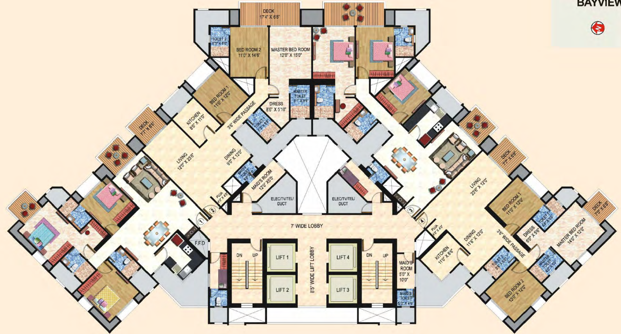
STILT + 40 FLOORS