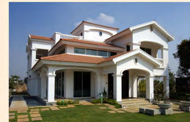
The Villas, Devanahalli, Bengaluru