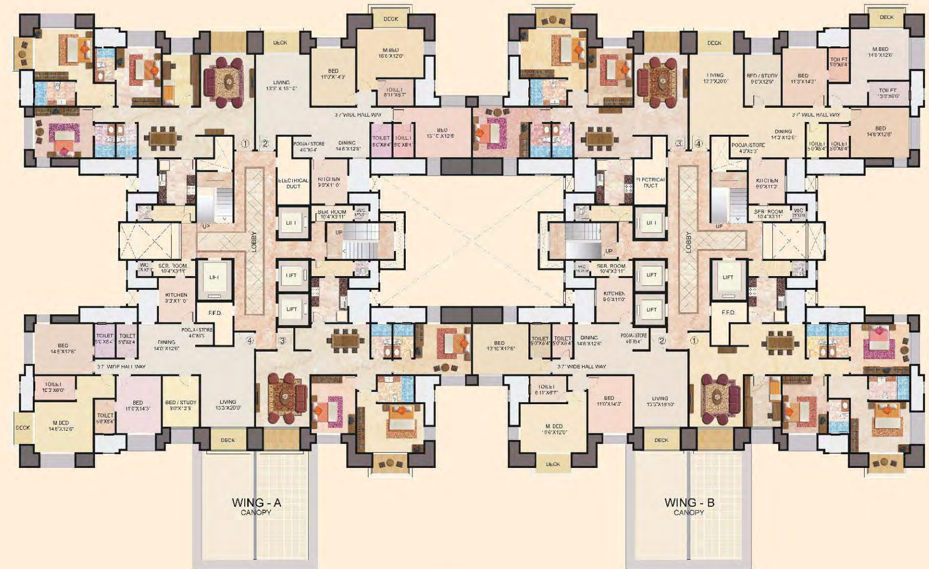
STILT + 28 FLOORS