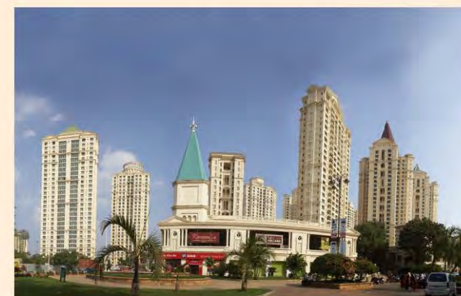
Hiranandani Meadows, Thane