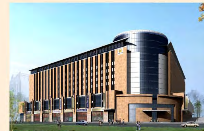
Electronic city, Bengaluru