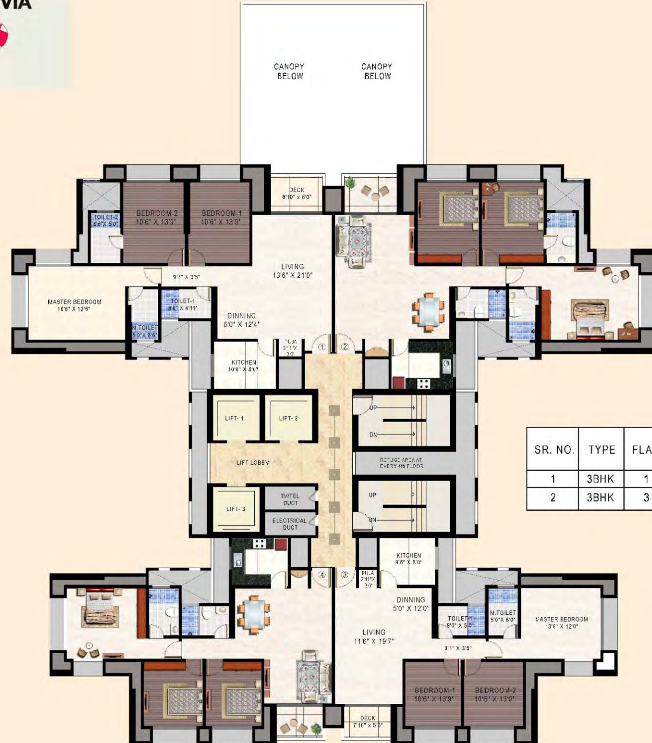
STILT + 25 FLOORS