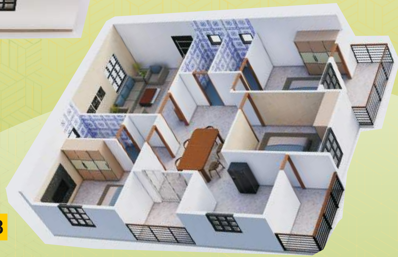
FLAT No. 4 & 8