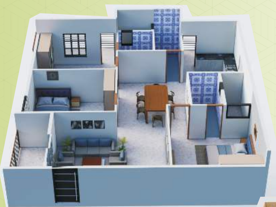
FLAT No. 2 & 6