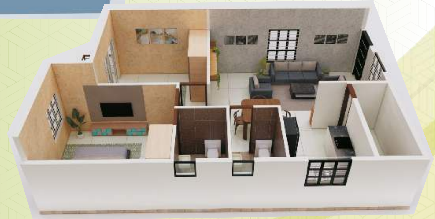
FLAT No. 15,16,17,18,19