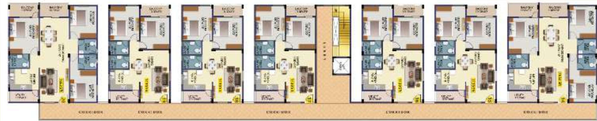
BLOCK - B