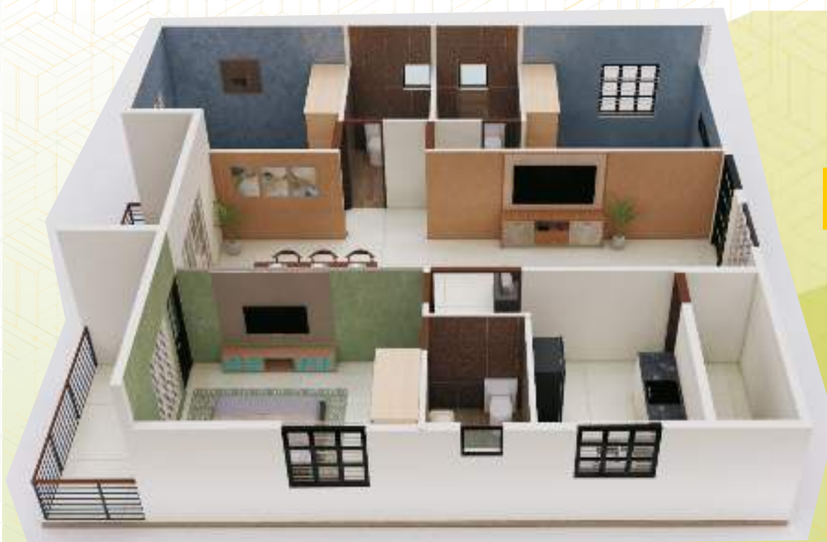
FLAT No. 14 & 20