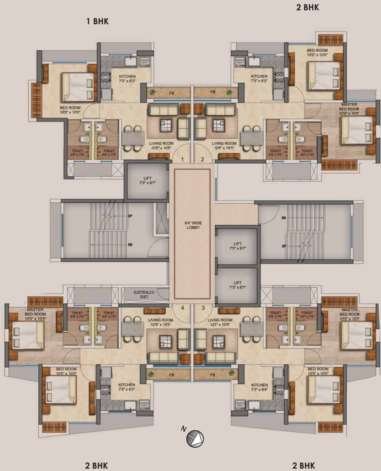
TYPICAL FLOOR PLAN - HESTIA