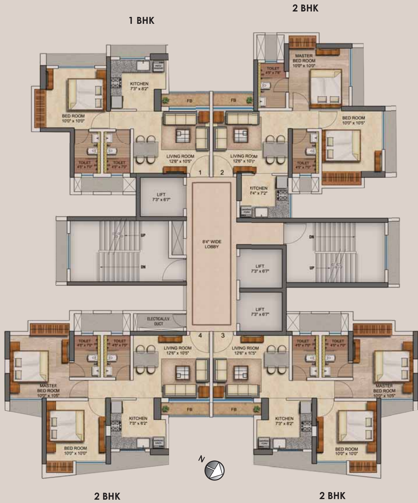
TYPICAL FLOOR PLAN - NYX