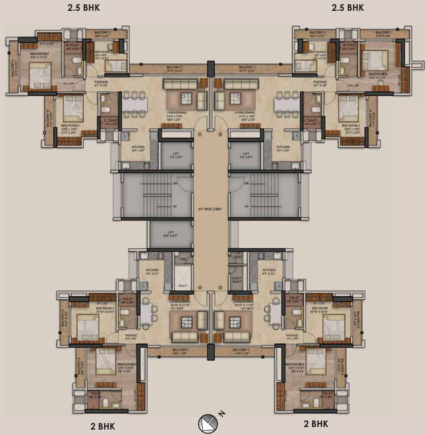
TYPICAL FLOOR PLAN - ATHENA