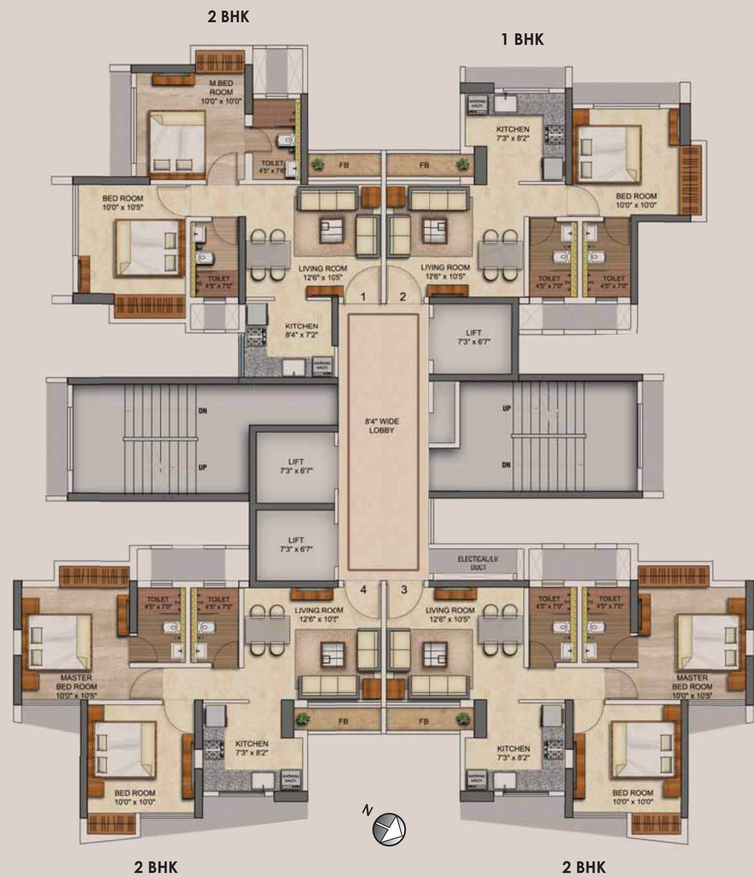
TYPICAL FLOOR PLAN - ARTEMIS