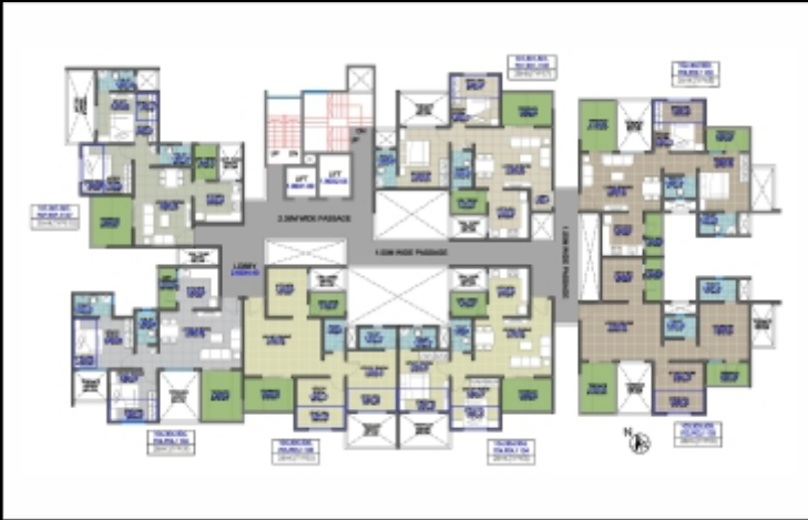
BUILDING F ODD FLOOR PLAN