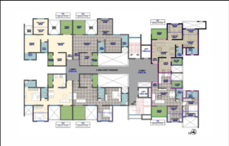
BUILDING E ODD FLOOR PLAN