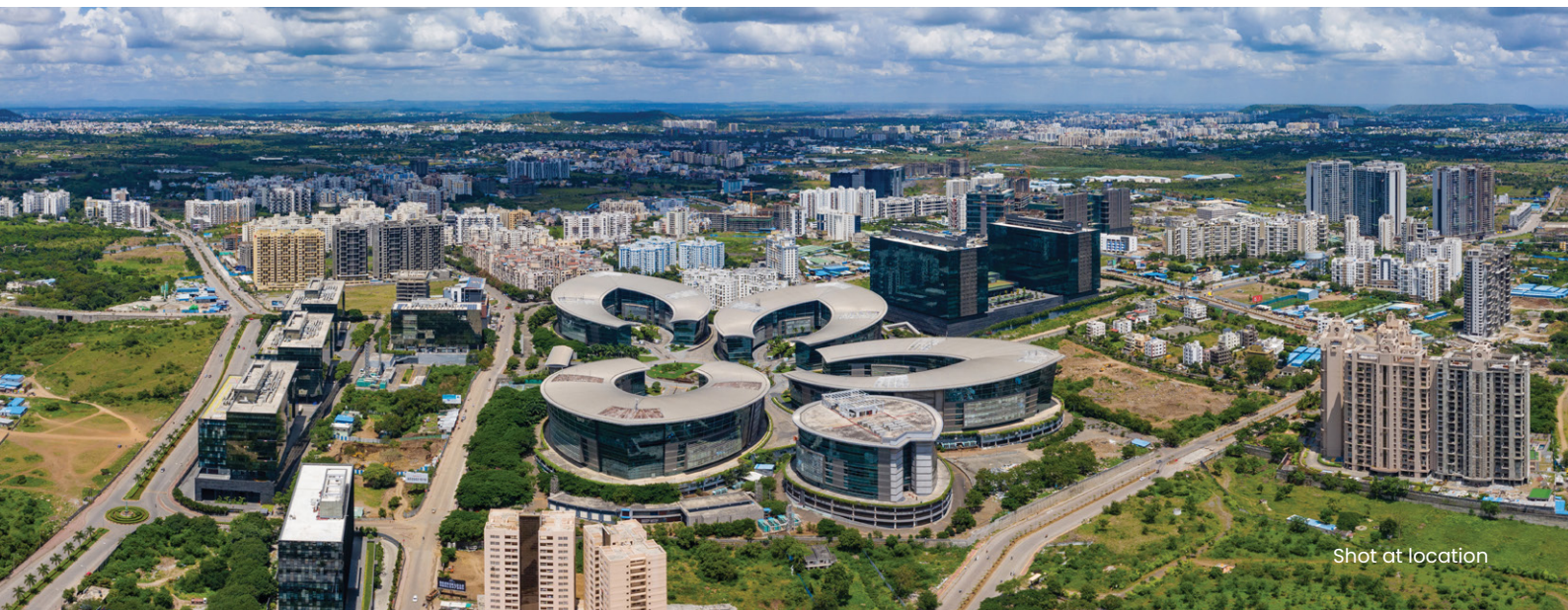
Shot at location