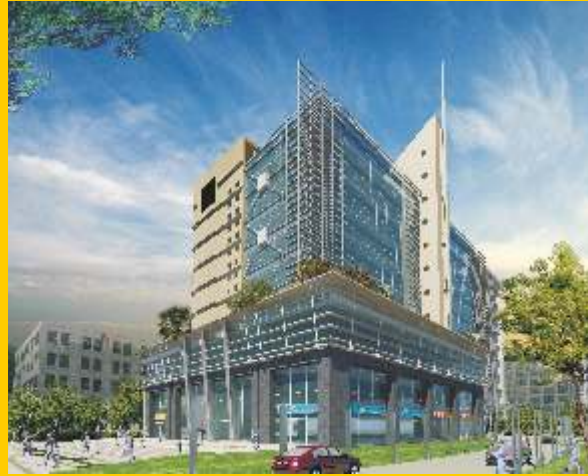
PRIDE HULKUL Lalbagh Road, Bangalore