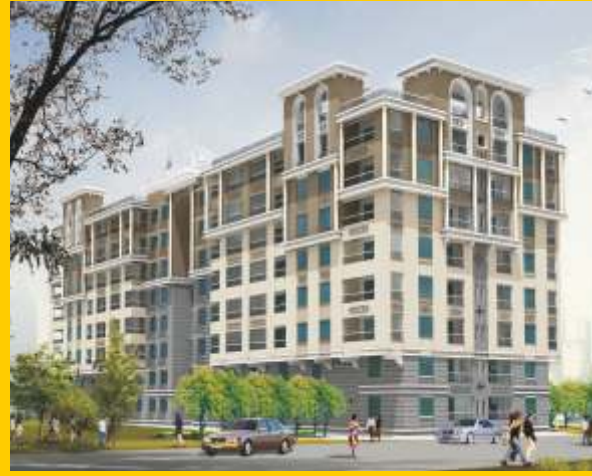
PRIDE PAVILION West of Chord Road, Bangalore