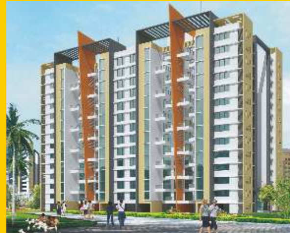
PRIDE PLATINUM Baner, Pune

As custodians of some of the most exclusive and aspired-for real estate projects in Pune, Bangalore and Mumbai, Pride Group invites you to a world where growth is synonymous with excellence and where spacious design, attention to detail and quality construction come above all else. As we expand our horizons across India we continue to re-define the skyline wherever we go. Here, we are proud to offer you, our esteemed customer, the best there is to buy.