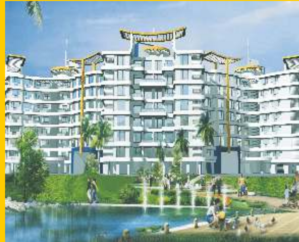
SAPPHIRE PARK Park Street, Pune