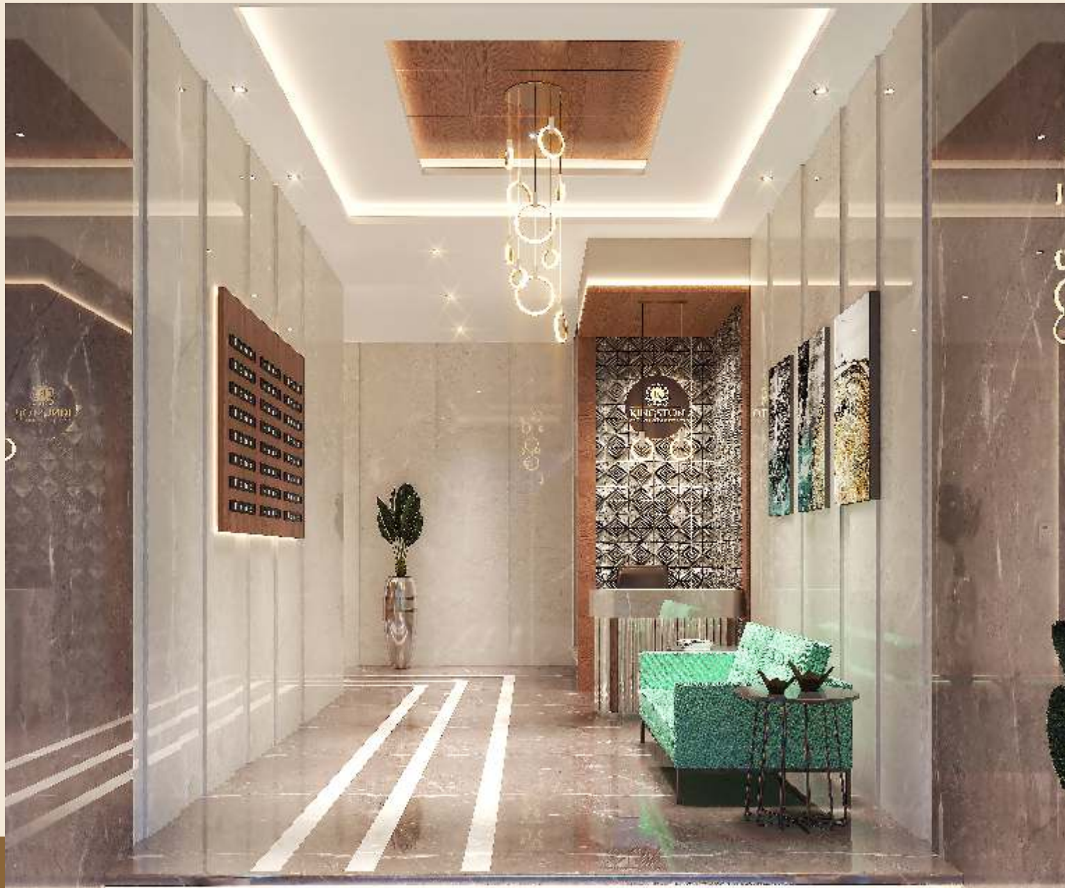
LUXURIOUS ENTRANCE LOBBY