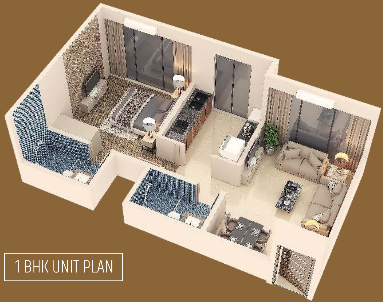
1 BHK UNIT PLAN