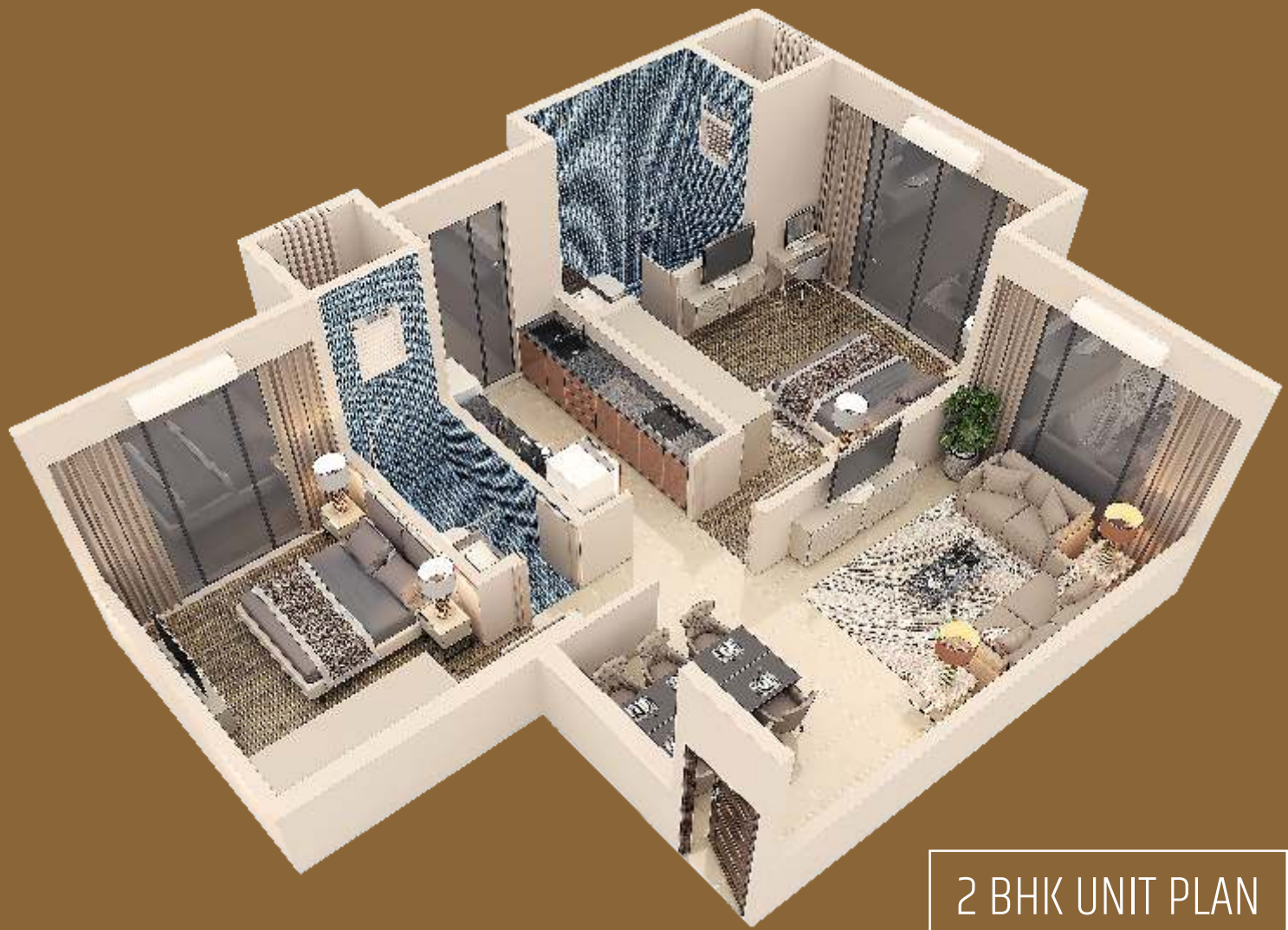
2 BHK UNIT PLAN