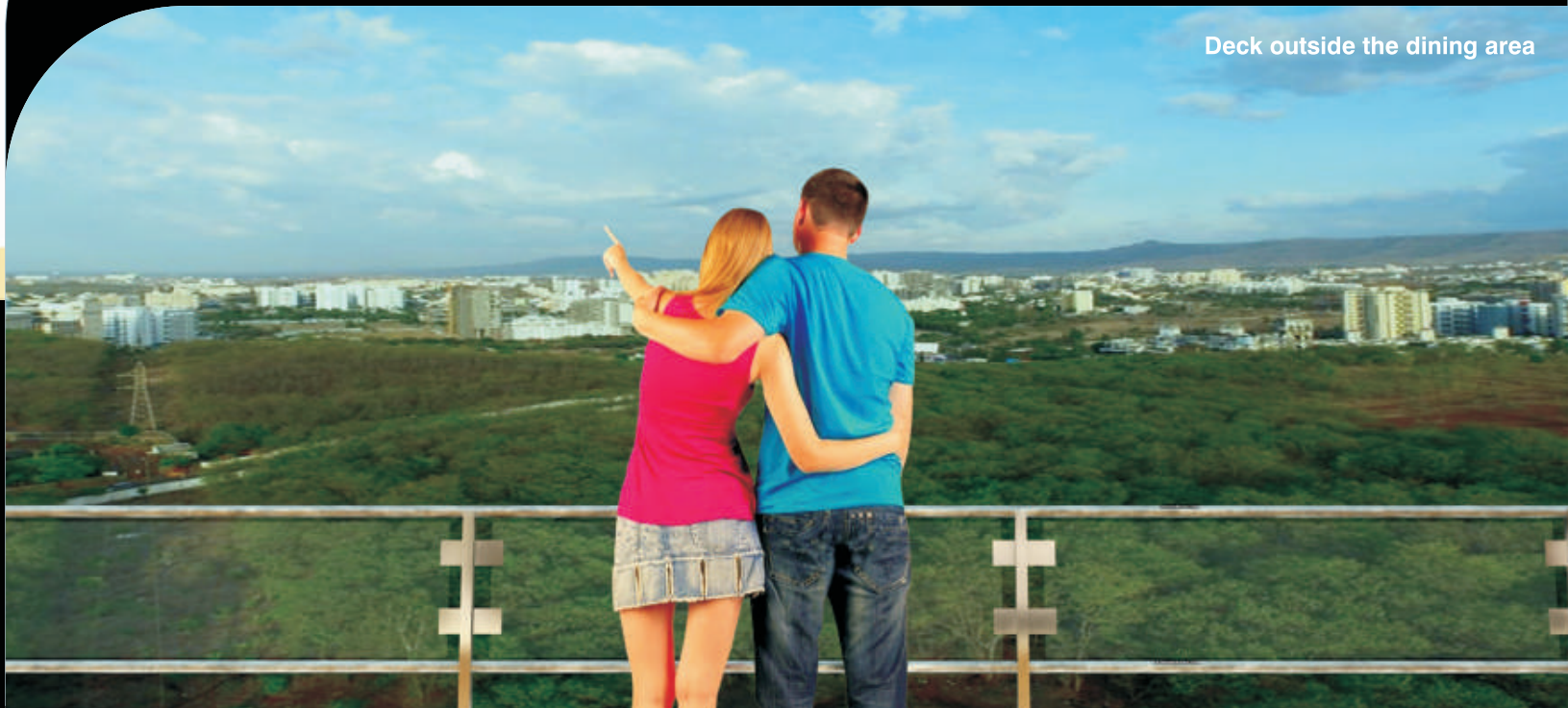
Deck outside the dining area

It's the people that make a home, not brick, cement and mortar. But there's very little brick and mortar that offers luxury, comfort, convenience, privacy and a retreat from the cacophony of the city. Eastwoods serves up all this and more in a cocktail that can't be unmixed. American writer Laura Ingalls Wilder once said, "Home is the nicest word there is." We agree and when you choose Eastwoods, you will too.