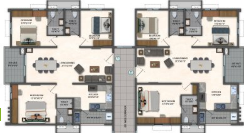
3 BHK-1585 Sft.