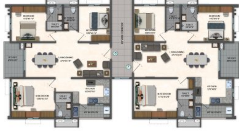
3 BHK-1585 Sft.