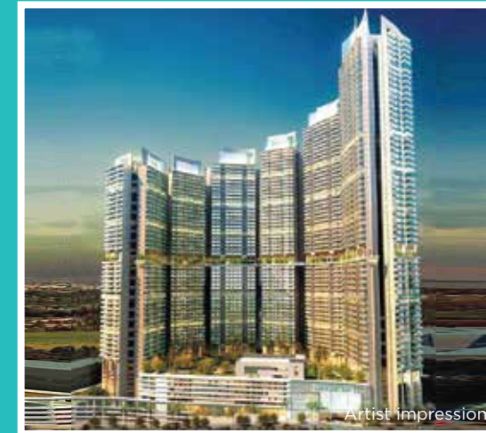
Crescent Bay, Parel