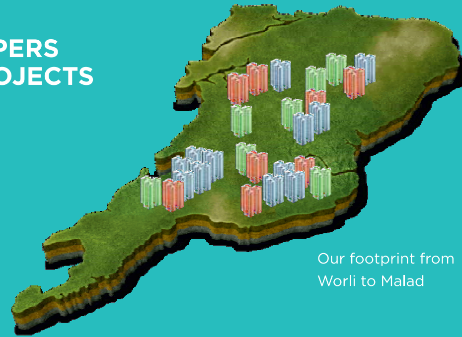
Our footprint from Worli to Malad

Additional 60 Mn. Sq. Ft. Upcoming Projects