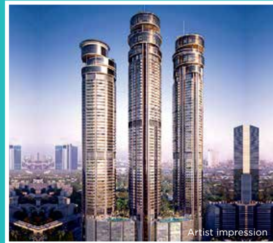
Omkar 1973 Worli