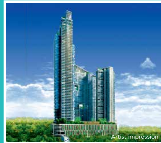
Omkar Alta Monte, Malad