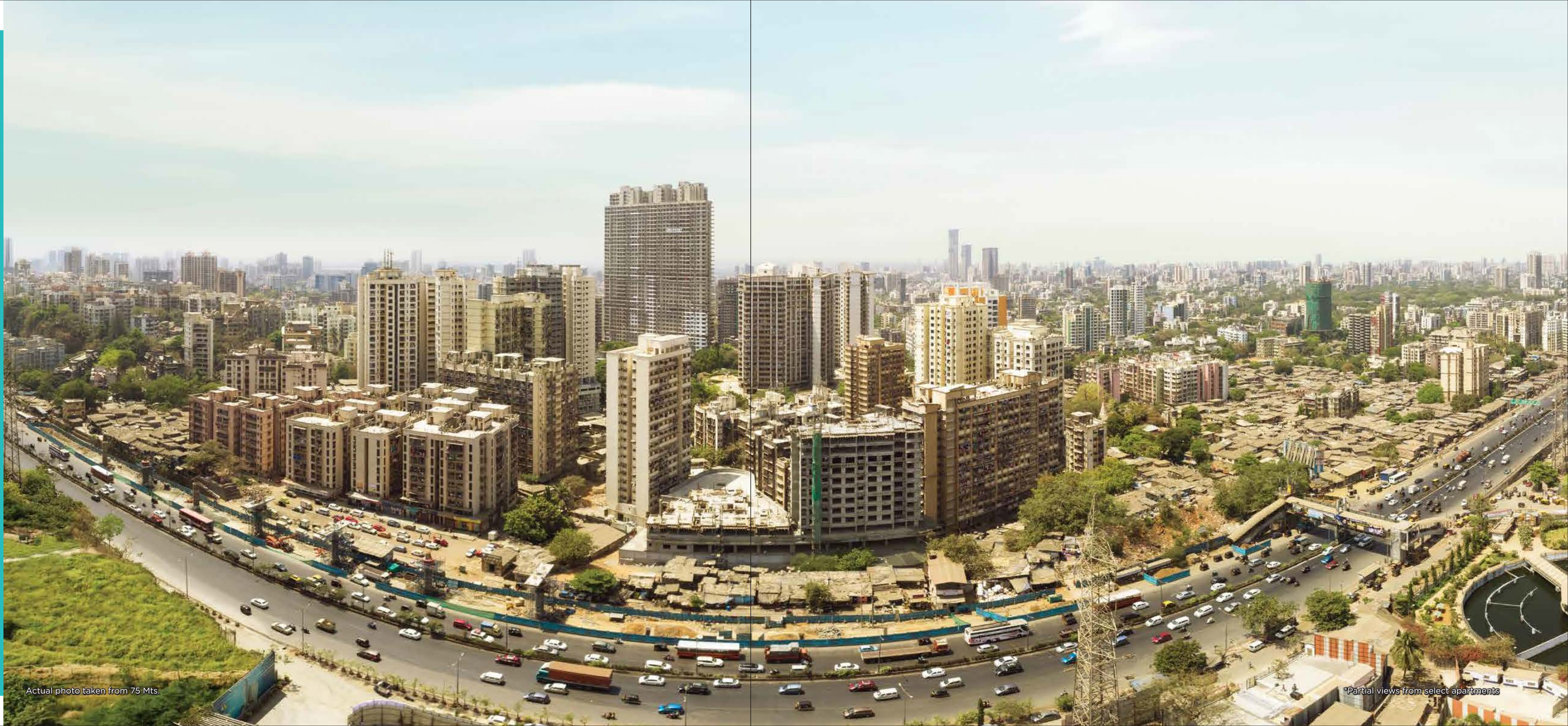
Actual photo taken from 75 Mts.