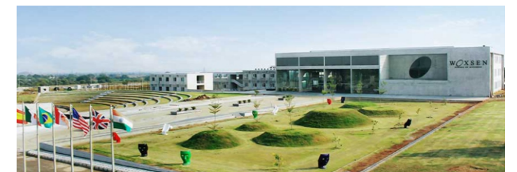
WOXSEN SCHOOL OF BUSINESS