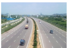
OUTER RING ROAD