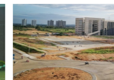
IIT - HYDERABAD