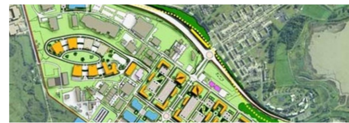
NIMZ - ZAHEERABAD