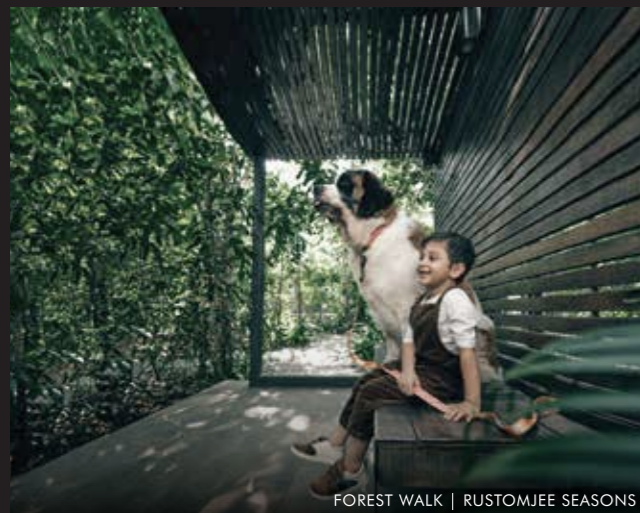
FOREST WALK | RUSTOMJEE SEASONS