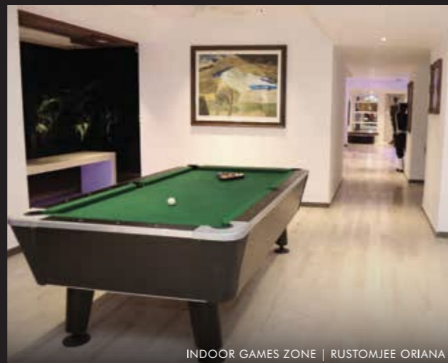
INDOOR GAMES ZONE | RUSTOMJEE ORIANA