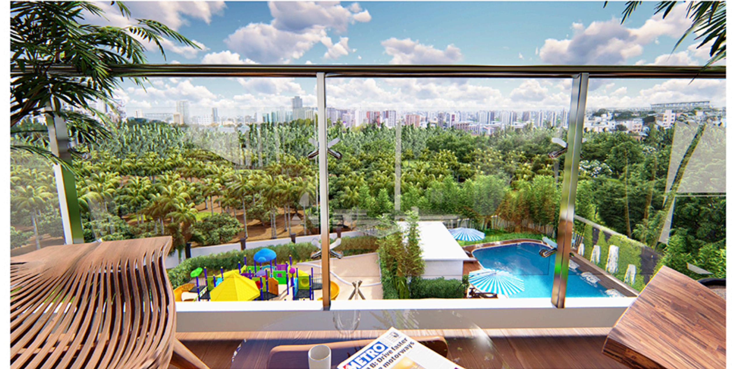
2 & 3 BHK Luxury Apartments @ Uttarahalli main road