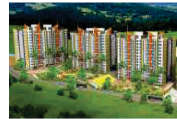
PRIDE PLATINUM Baner