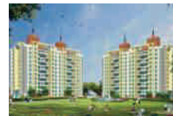
PARK ROYAL Wakad