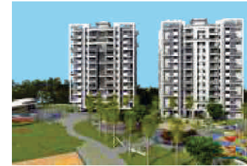
ALOMA COUNTY Aundh