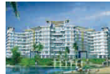
SAPPHIRE PARK Park Street, Wakad