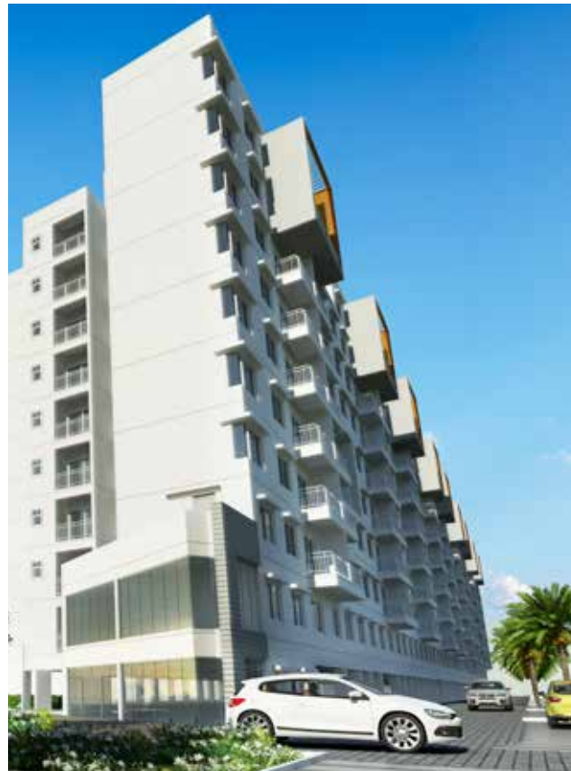
SIPANI BLISS II