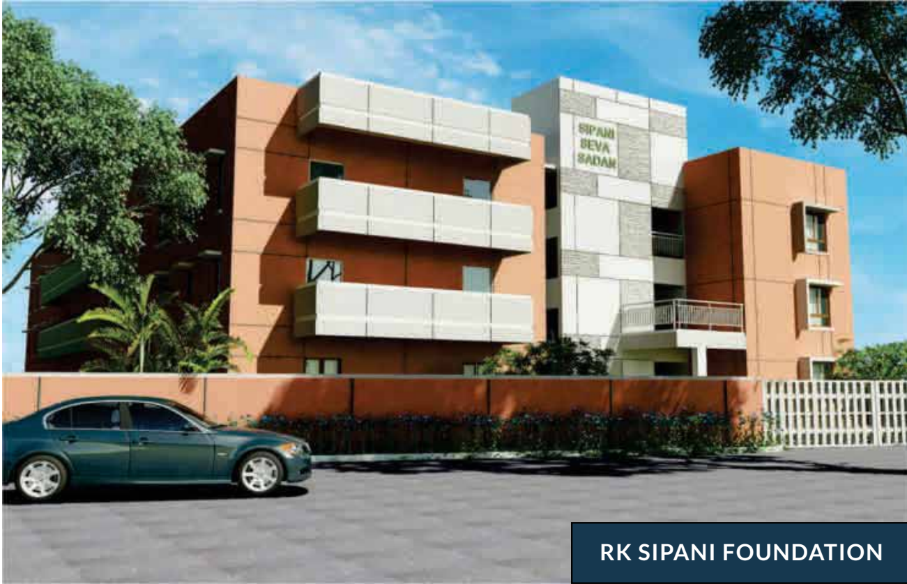
RK SIPANI FOUNDATION