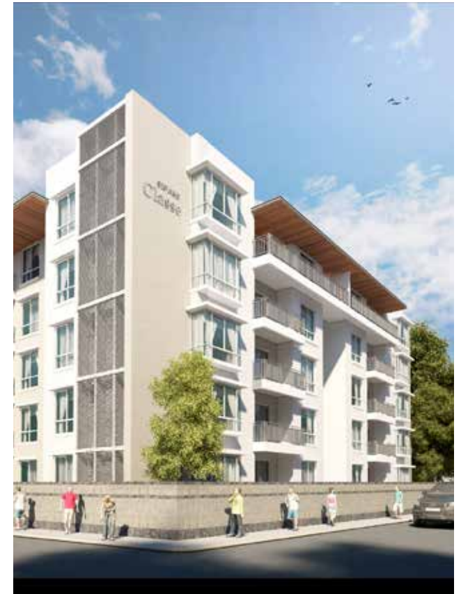
SIPANI CLASSE I & II