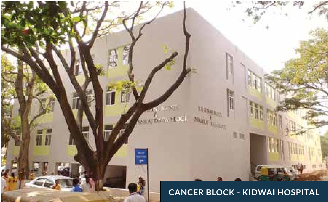
CANCER BLOCK - KIDWAI HOSPITAL