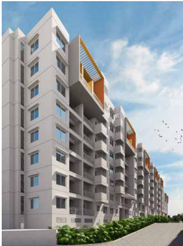
SIPANI BLISS I