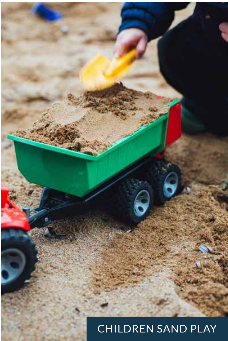
CHILDREN SAND PLAY