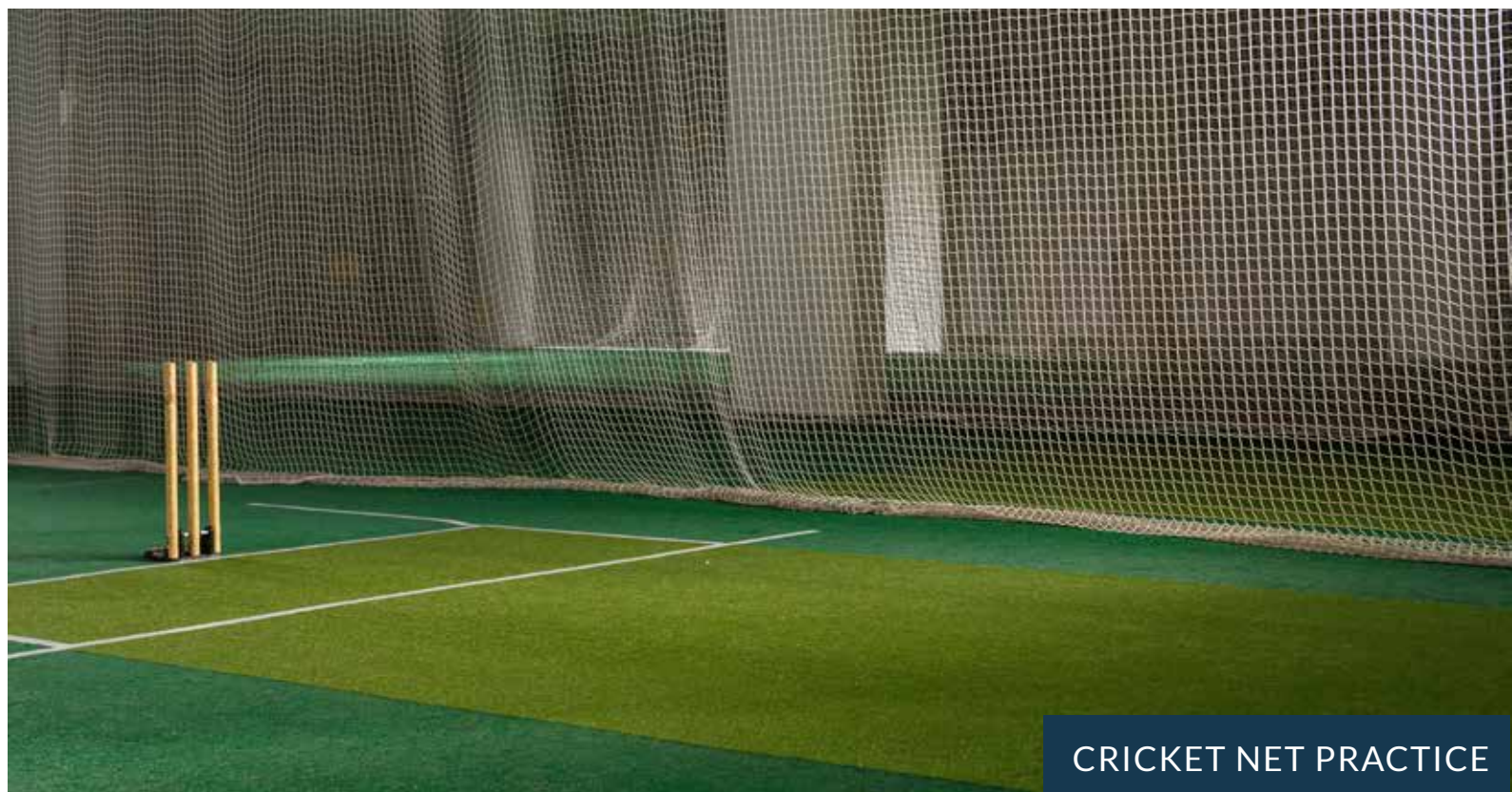
CRICKET NET PRACTICE