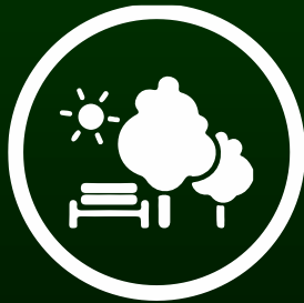
Senior Citizen's Park