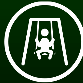
Kid's Play Area