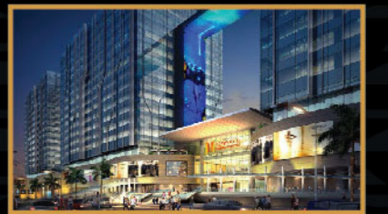
SEAWOODS GRAND CENTRAL MALL