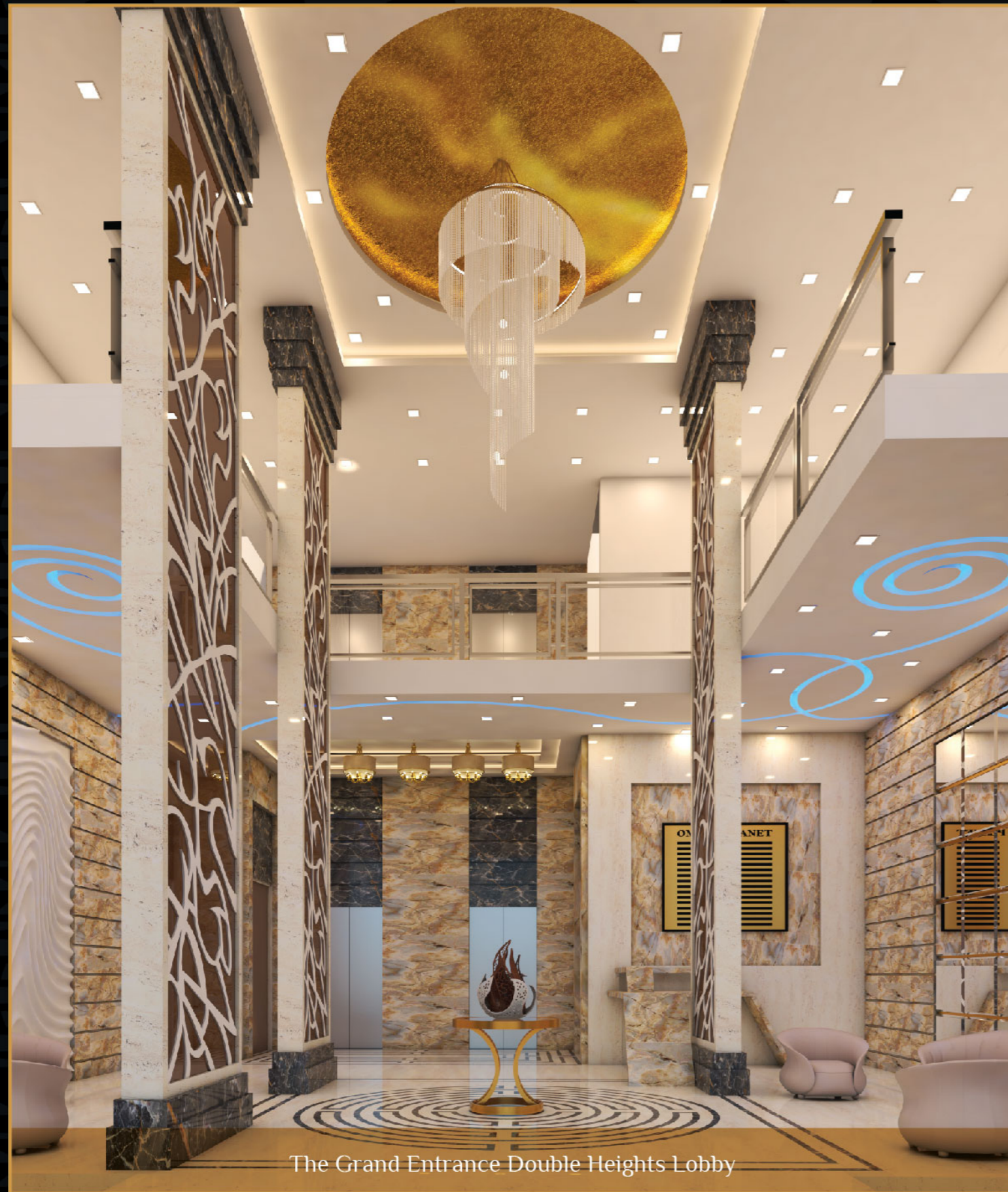
The Grand Entrance Double Heights Lobby