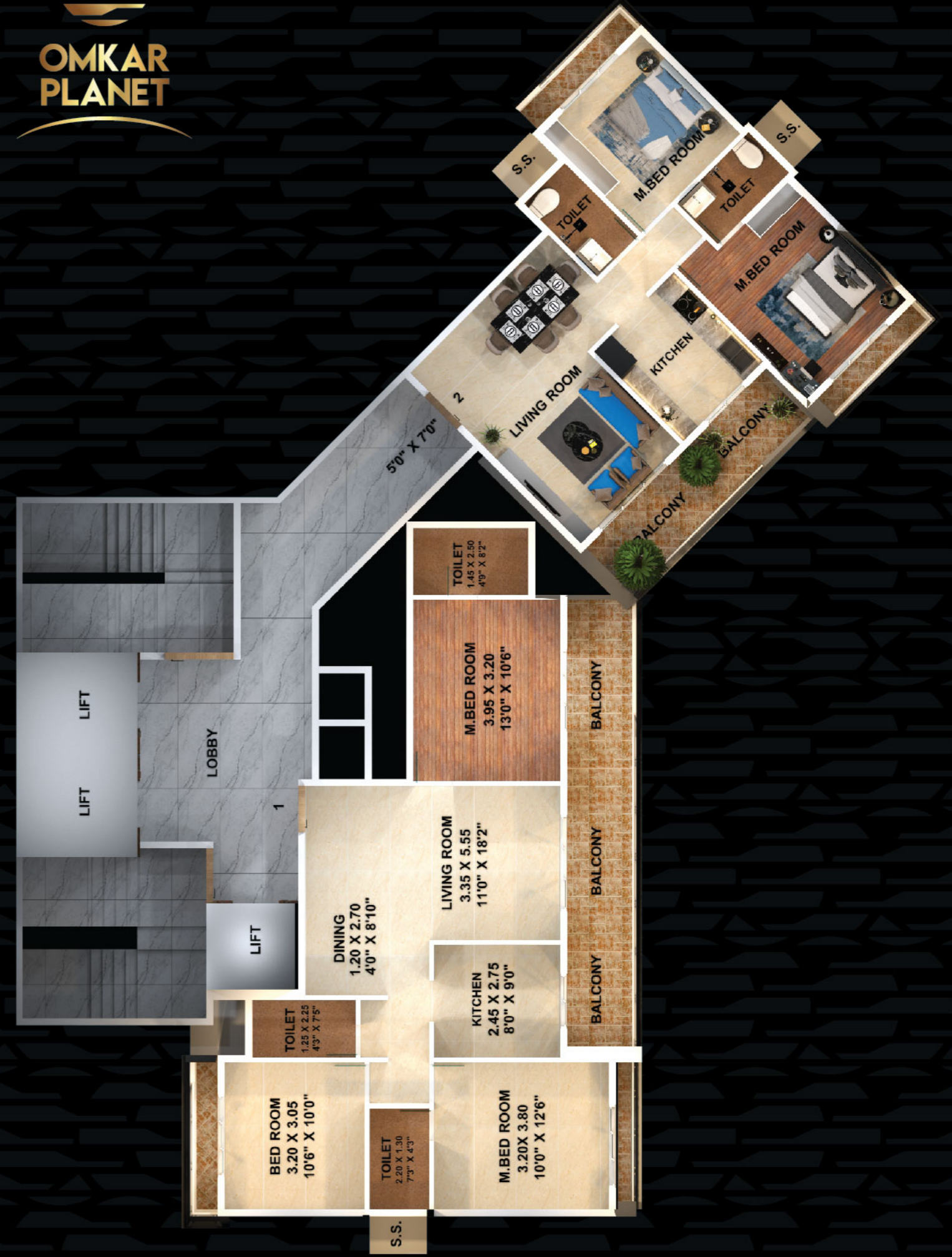
Typical Odd Floor Plan