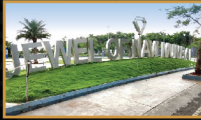
JEWEL OF NAVI MUMBAI