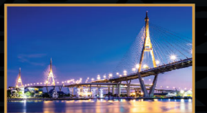
NHAVA-SHEVA SEA LINK