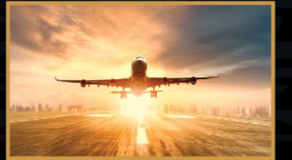
NAVI MUMBAI AIRPORT