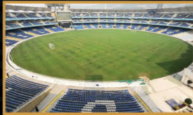
DY PATIL STADIUM