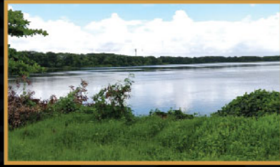
PALM BEACH LAKE