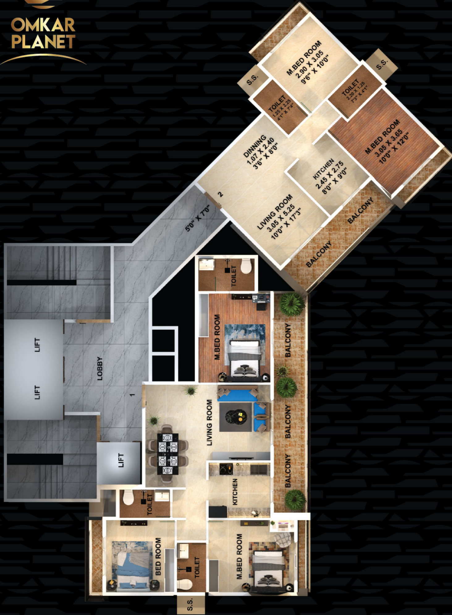
Typical Even Floor Plan