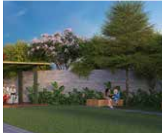
Out door gym Hammock Park