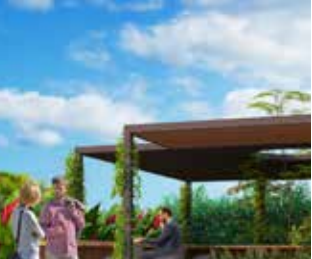
Rooftop Barbecue and party area