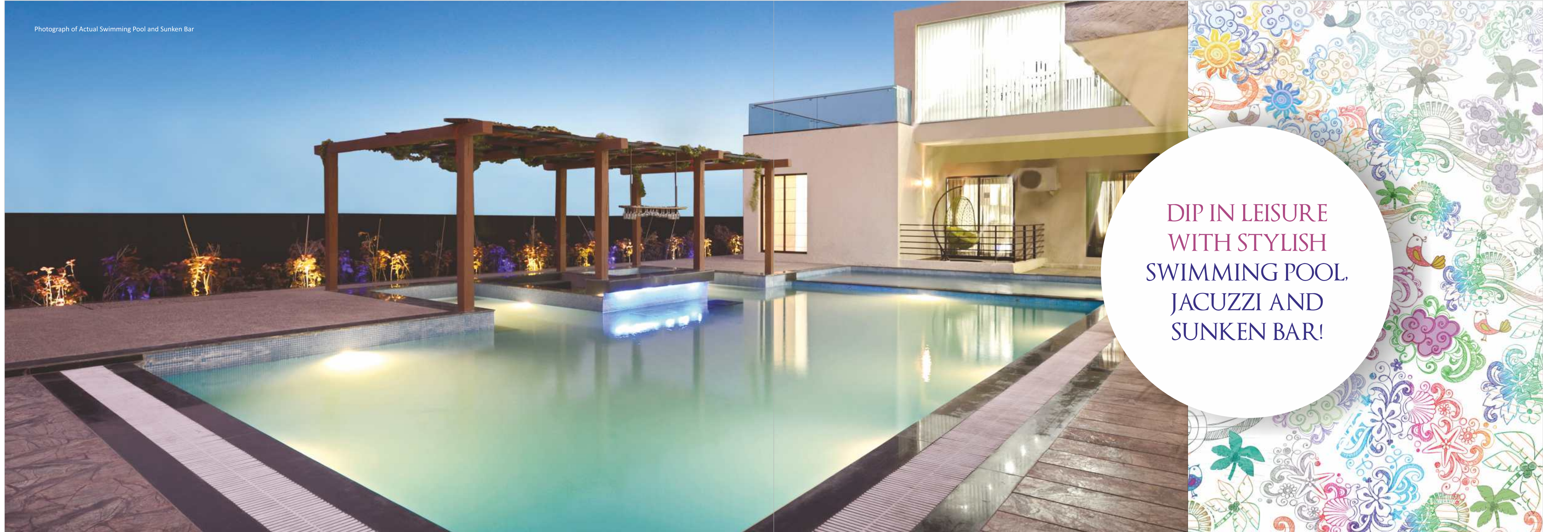
Photograph of Actual Swimming Pool and Sunken Bar

DIP IN LEISURE WITH STYLISH SWIMMING POOL, JACUZZI AND SUNKEN BAR!