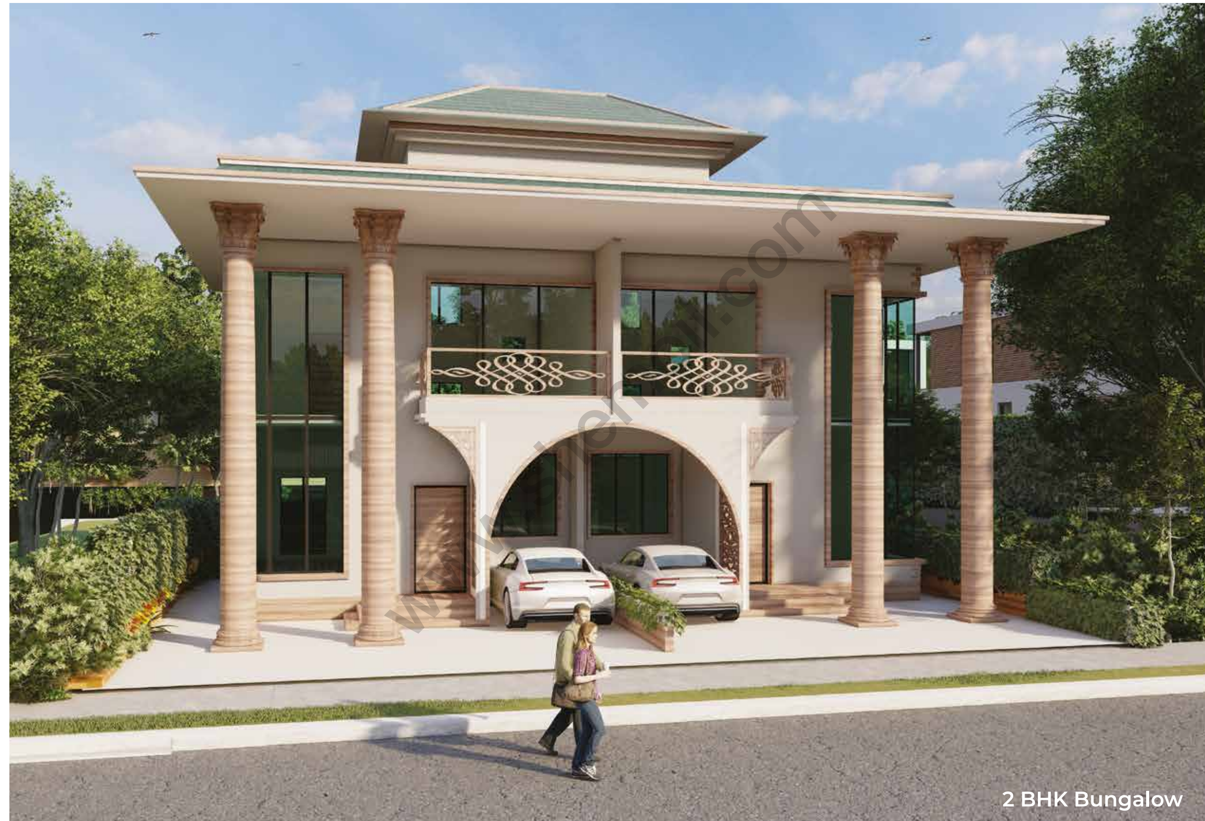
2 BHK Bungalow