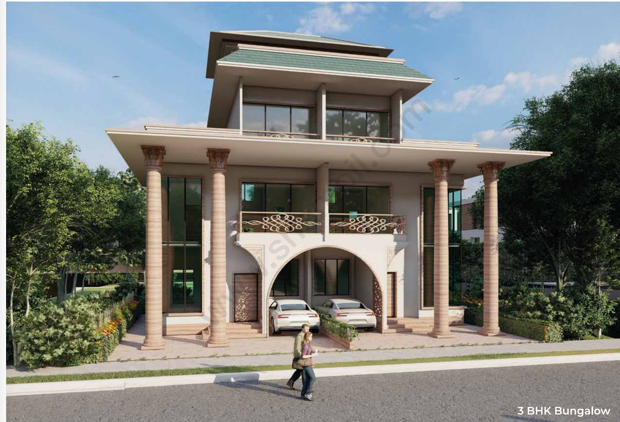
3 BHK Bungalow