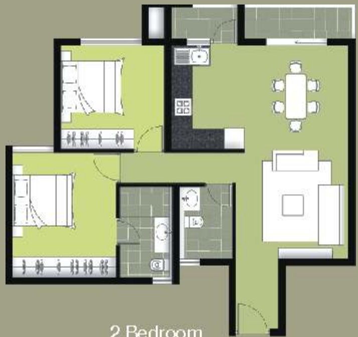
2 Bedroom Area: 969 sq. ft.