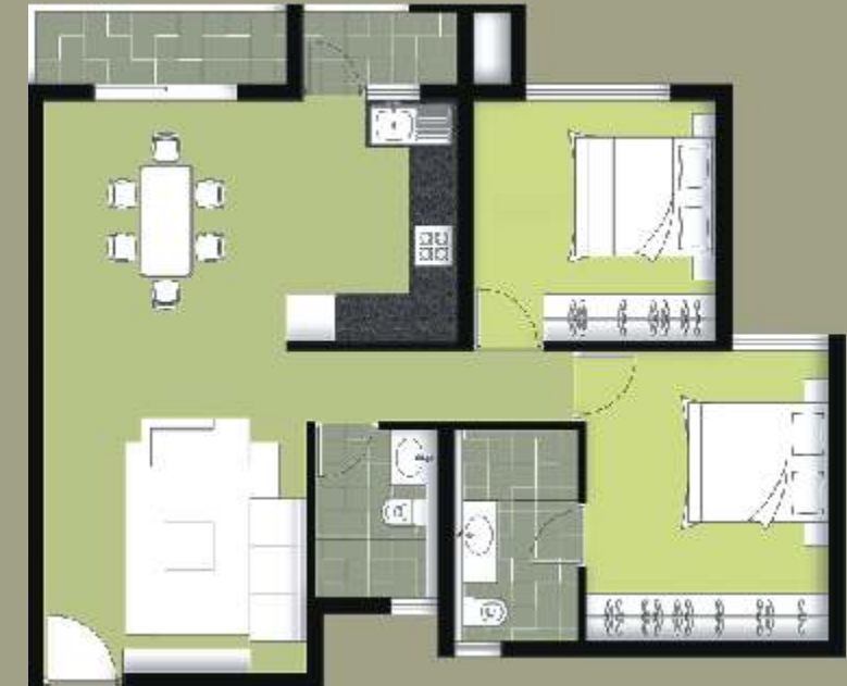
2 Bedroom Area: 965 sq. ft.