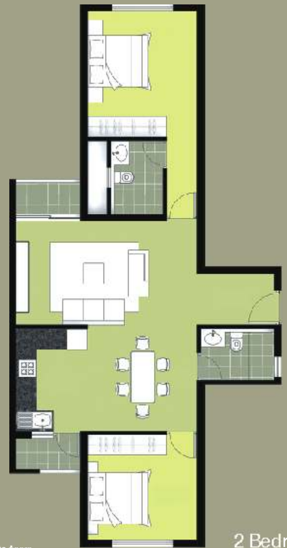
2 Bedroom Area: 1021 sq. ft.