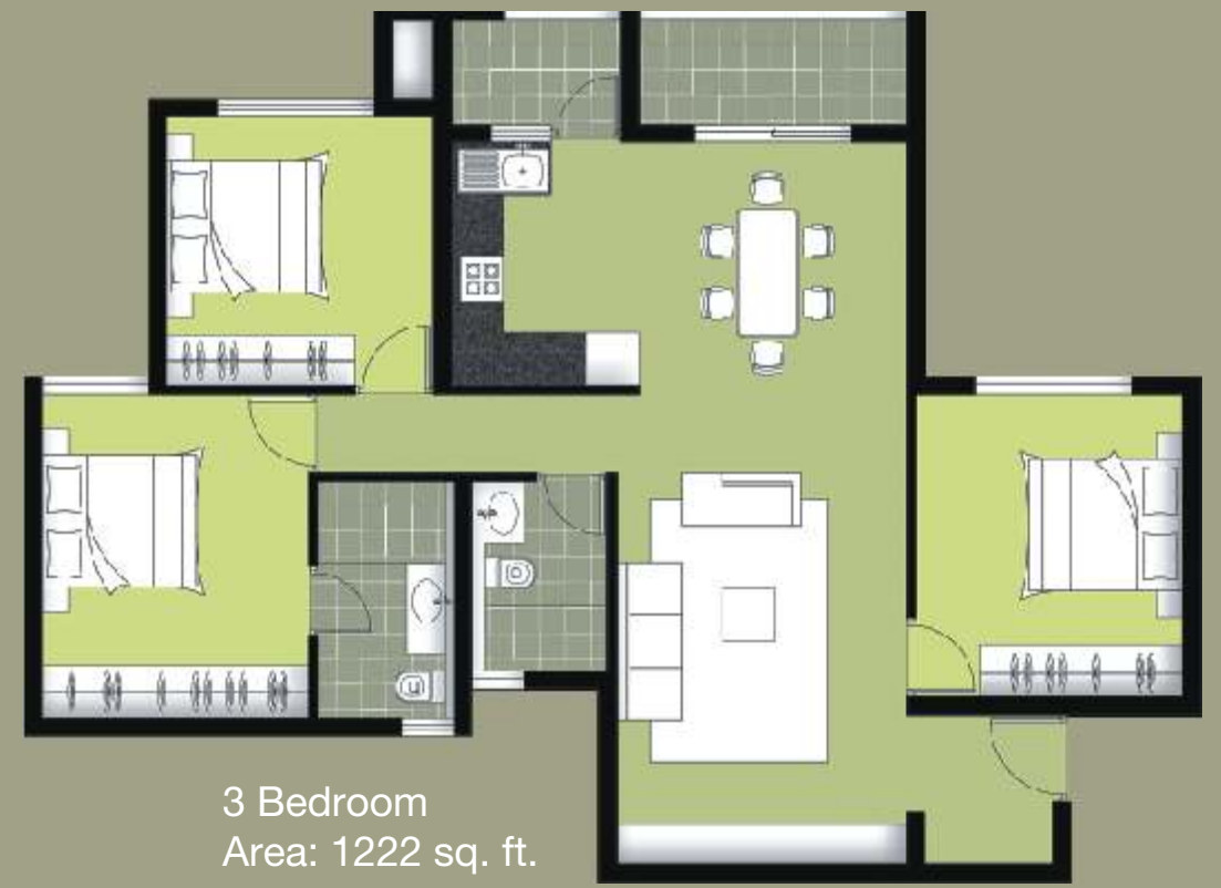
3 Bedroom Area: 1222 sq. ft.

Areas indicated are of typical units. There may be variations in unit plans according to floors.