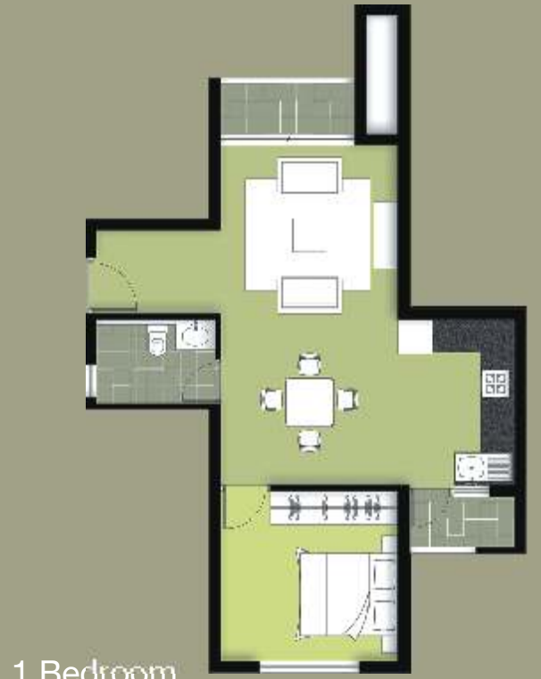
1 Bedroom Area: 688 sq. ft.