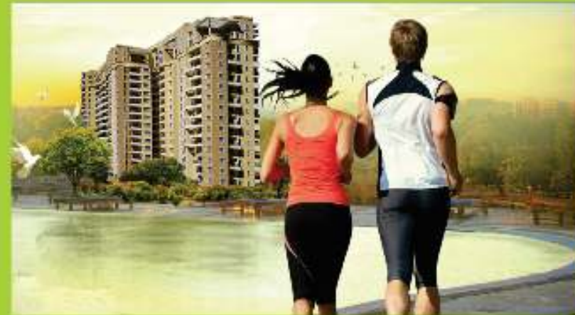
SNN Raj Lakeview - BTM 2nd Stage

Hop to Work, enjoy stress-free life. Smaller Community. Unique Amenities with a touch of Novelty like Rock Climbing Wall, Planet Cardio Gym