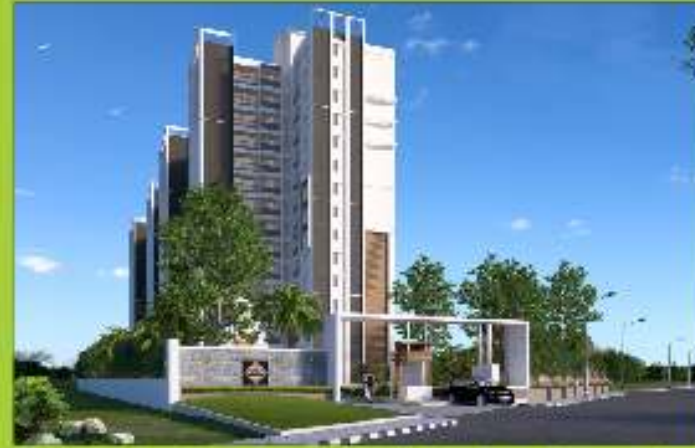
SNN Raj Grandeur - Bommanahalli, 2km. from Koramangala

4.5 Acres - 355 Units, 7 Towers, G + 14 Floors 2 BHK 1215 - 1495 Sft. and 3 BHK 1360 - 1885 Sft. SNN Signature Landscape and Fully Loaded Club House. Most of the Apartments are 4 sides open