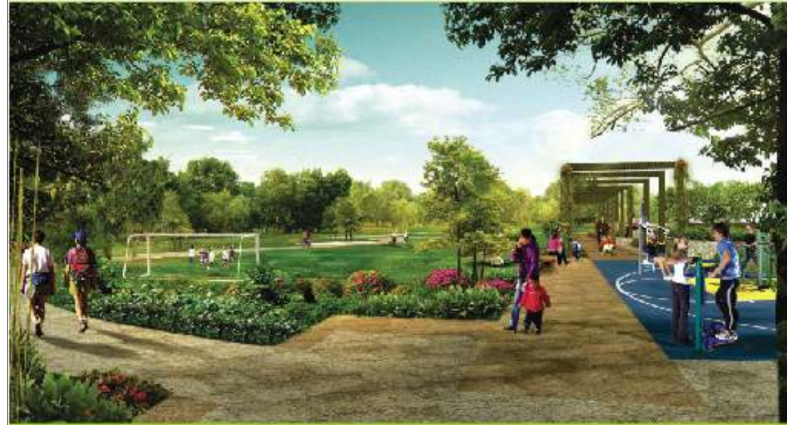
Architect's perspective of Greenbay Walking Trail & Mini Soccer Play Area

Touch of Nature makes the whole world kin.