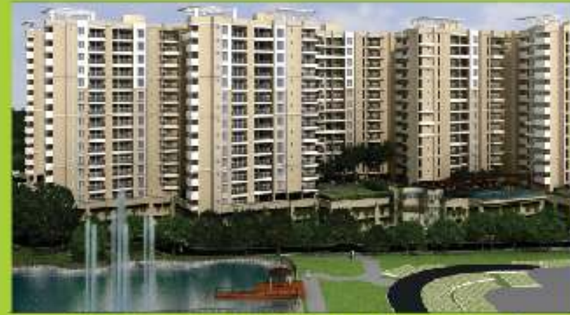
SNN Raj Serenity - Begur Main Road, off Bannerghatta road

4.5 Acres - 355 Units, 7 Towers, G + 14 Floors 2 BHK 1215 - 1495 Sft. and 3 BHK 1360 - 1885 Sft. SNN Signature Landscape and Fully Loaded Club House. Most of the Apartments are 4 sides open