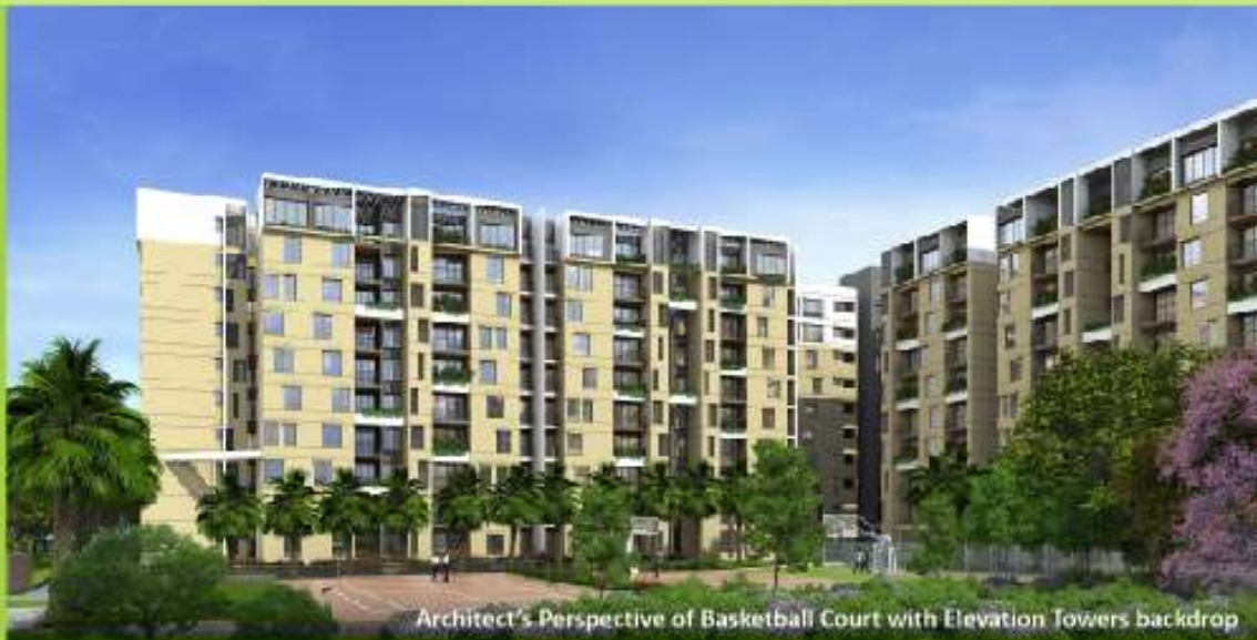
Architect's Perspective of Basketball Court with Elevation Towers backdrop

Nature has songs for those who have time to hear.