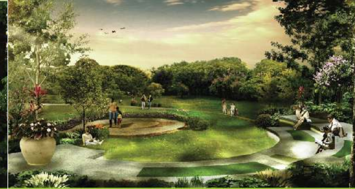
Architect's perspective of Greenbay Amphitheater with Forest backdrop

The best way to thank nature is to live with it.