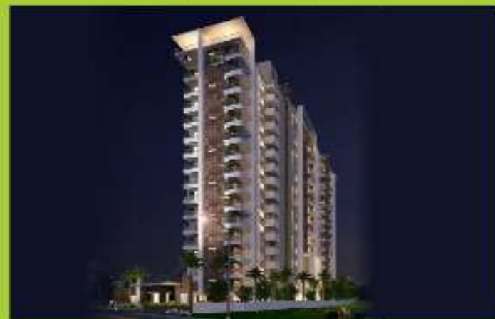
SNN Raj Spiritua - Banashankari

4.5 Acres - 181 Units, 3 Towers of G + 17 Floors 3 BHK 2250 - 2400 Sft., 4 BHK 3000 - 3300 Sft. and 5 BHK 5450 Sft. Ready to occupy, Five Star Clubhouse and Signature Landscape. 500 Mtrs. from Madiwala Lake