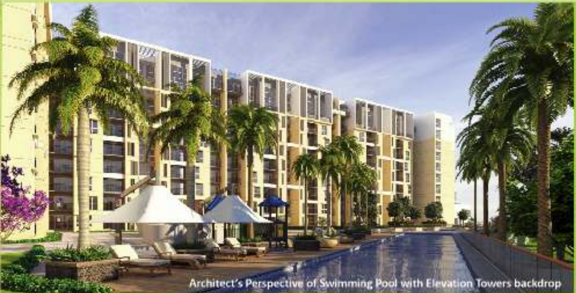
Architect's Perspective of Swimming Pool with Elevation Towers backdrop