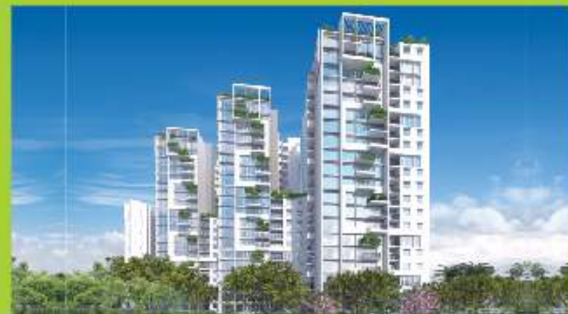
SNN Raj Eternia - Harlur Road, Sarjapur

High-end Apartments, Marble Flooring for entire Apartment Signature Clubhouse. Motion controlled lights for toilets, digital locks