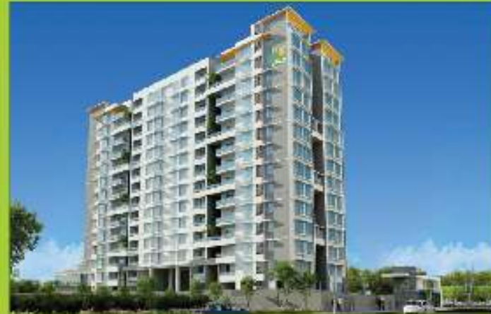
SNN Raj Neeladri - Electronic City Ph 1

30 Acres - 2500+ Units, G + 13 Floors 2 BHK 905 - 1250 Sft., 3 BHK 1150 - 1960 Sft. and 4 BHK 2180 Sft. One Lakh Sft. Clubhouse, biggest in Bangalore. 3 Sides Open Apartments, Natural and Man-made Lakes