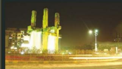
Shilp Chowk, Kharghar - Night View