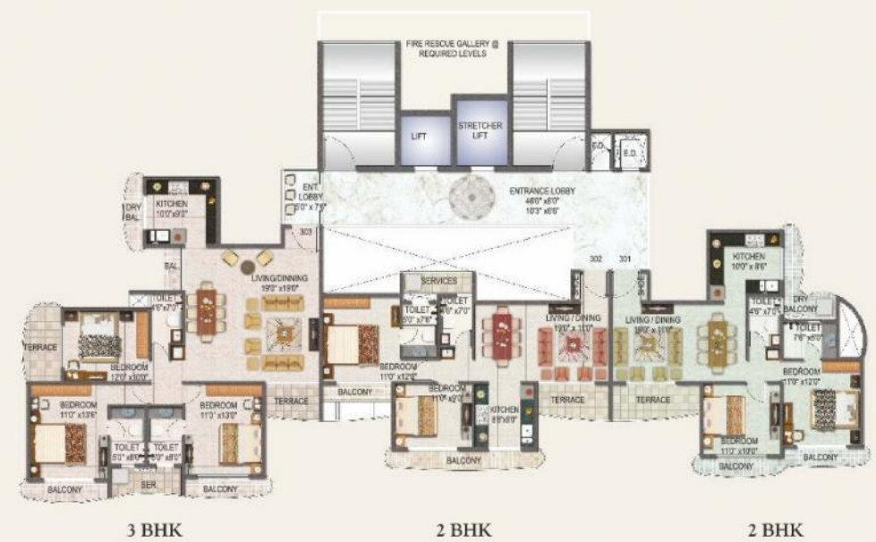
Typical Floor Plan (Odd)

( 3rd, 5th, 7th, 9th, 11th, 13th, 15th, 17th, 19th, 21st, 23rd, 25th & 27th Floor )