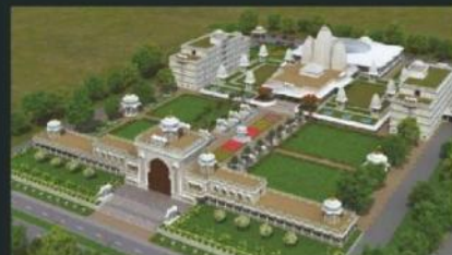
Proposed ISKCON Temple