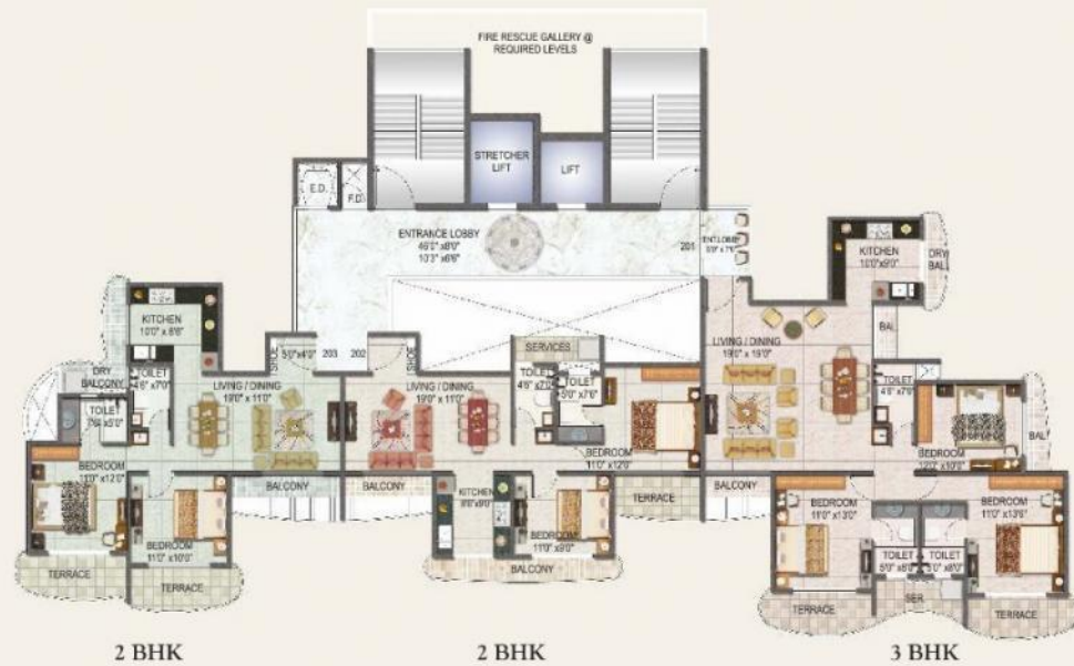
Typical Floor Plan (Even)

( 2nd, 4th, 6th, 8th, 10th, 12th, 14th, 16th, 18th, 20th, 22nd, 24th & 26th Floor )