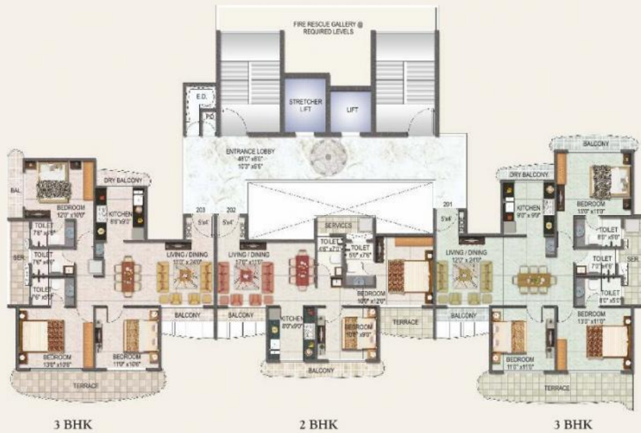
Typical Floor Plan ( Even )

( 2nd, 4th, 6th, 8th, 10th, 12th, 14th, 16th, 18th, 20th, 22nd, 24th & 26th Floor )