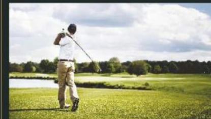
Golf Course, Kharghar