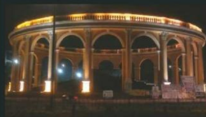
Utsav Chowk, Kharghar - Night View