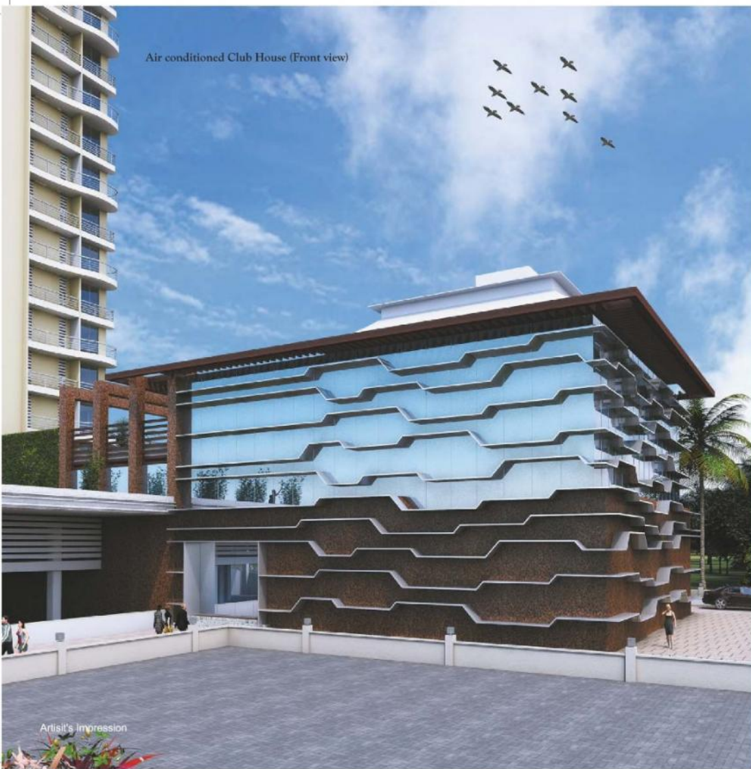
Air conditioned Club House (Front view)