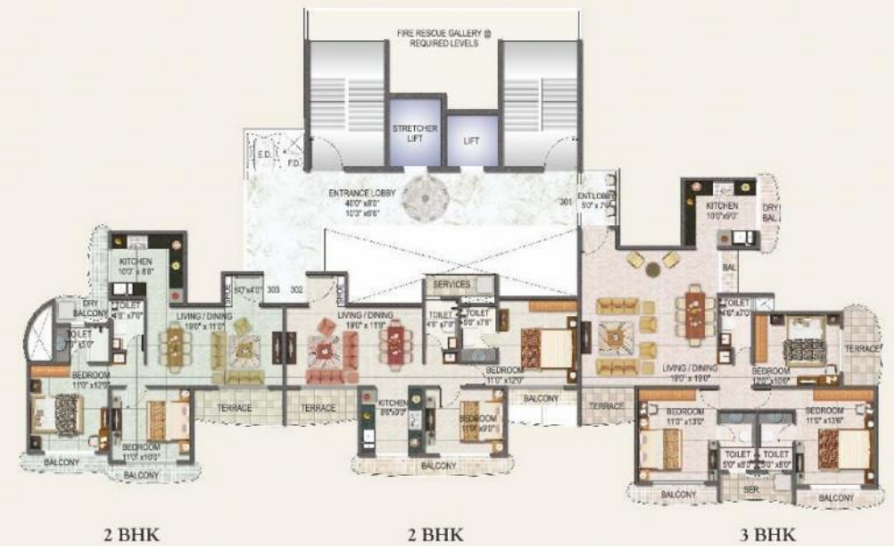
Typical Floor Plan (Odd)

( 3rd, 5th, 7th, 9th, 11th, 13th, 15th, 17th, 19th, 21st, 23rd, 25th & 27th Floor )