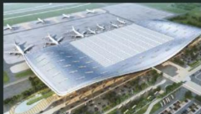
Proposed International Airport, Navi Mumbai