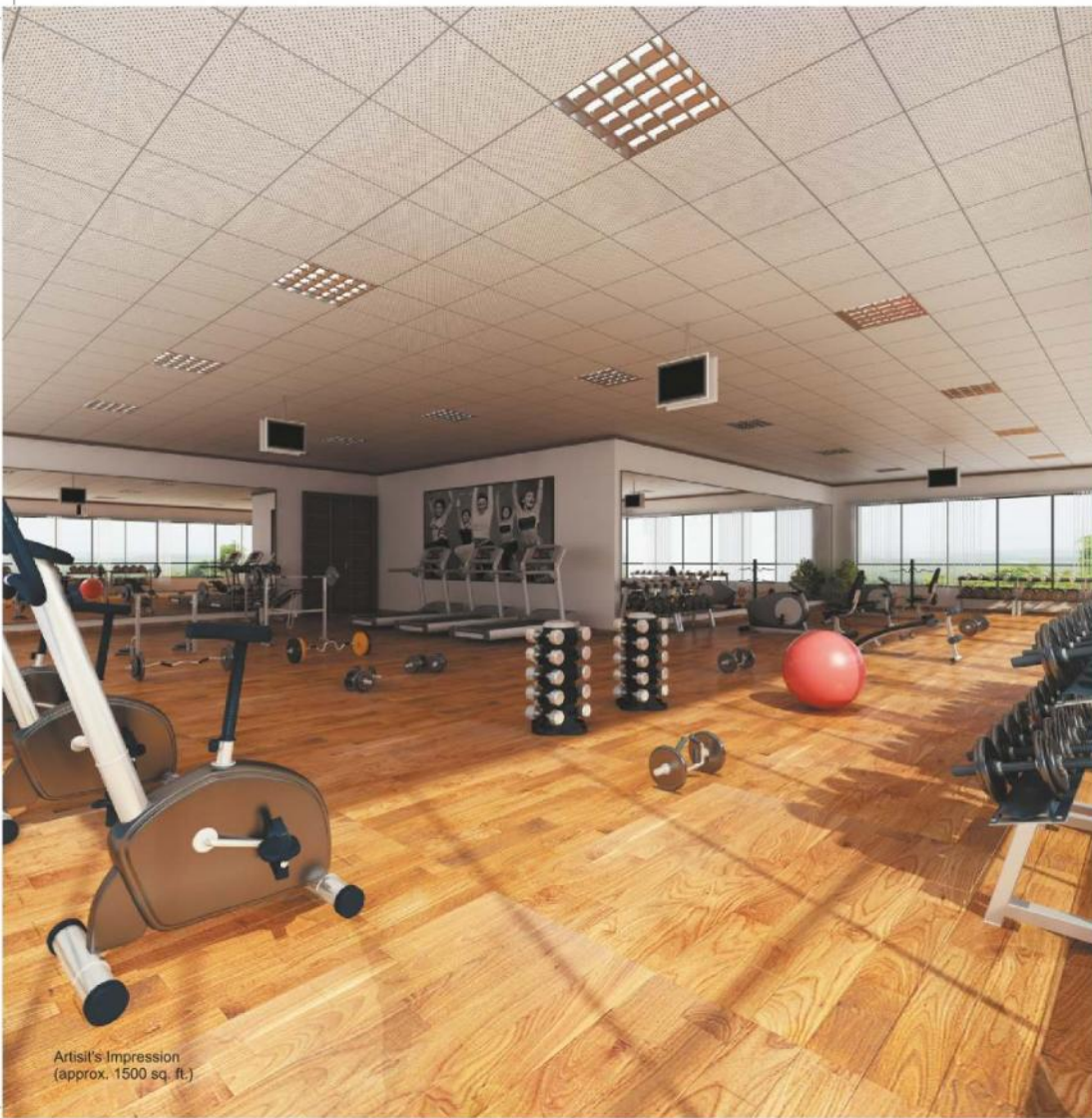
Artist's Impression (approx. 1500 sq. ft.)