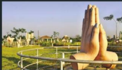
Central Park, Kharghar