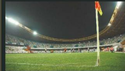
D.Y. Patil Stadium, Nerul