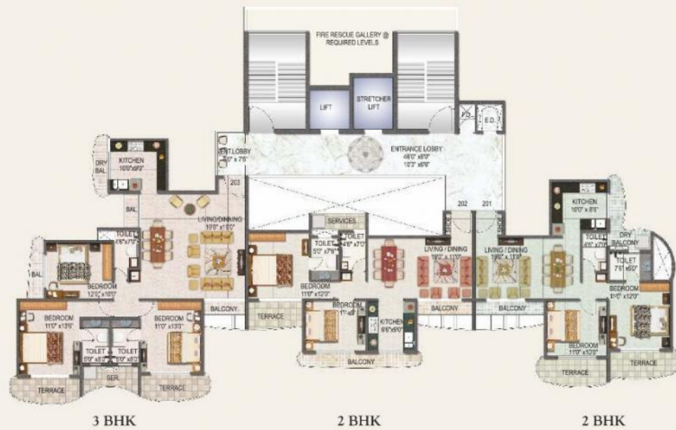
Typical Floor Plan (Even)

( 2nd, 4th, 6th, 8th, 10th, 12th, 14th, 16th, 18th, 20th, 22nd, 24th & 26th Floor )