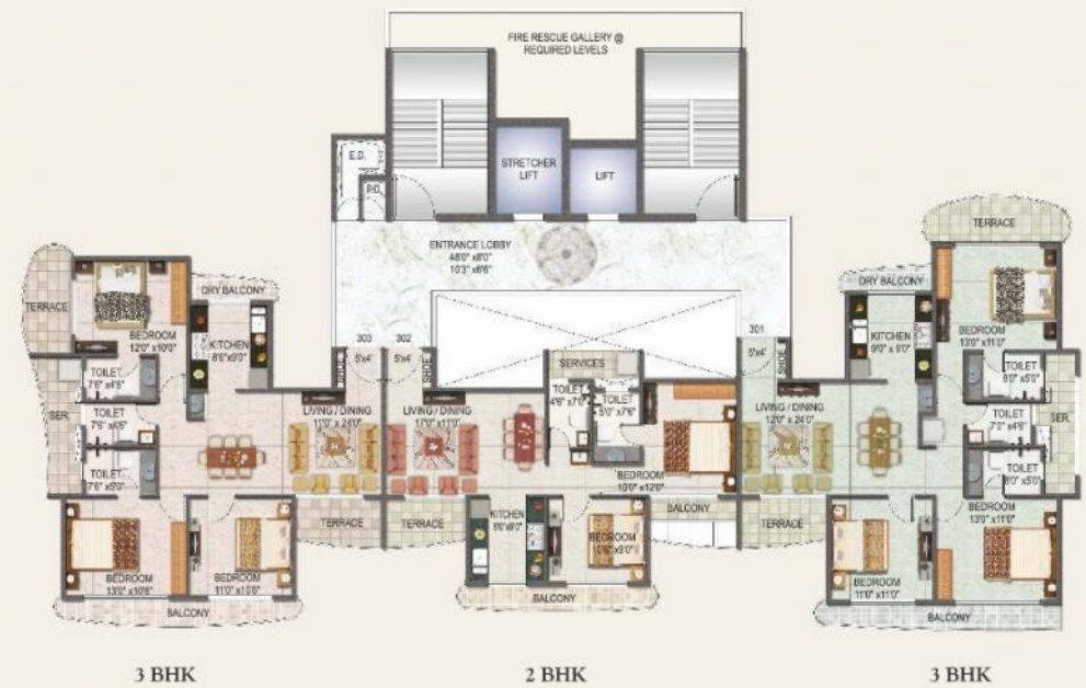
Typical Floor Plan ( Odd )

( 3rd, 5th, 7th, 9th, 11th, 13th, 15th, 17th, 19th, 21st, 23rd, 25th & 27th Floor )