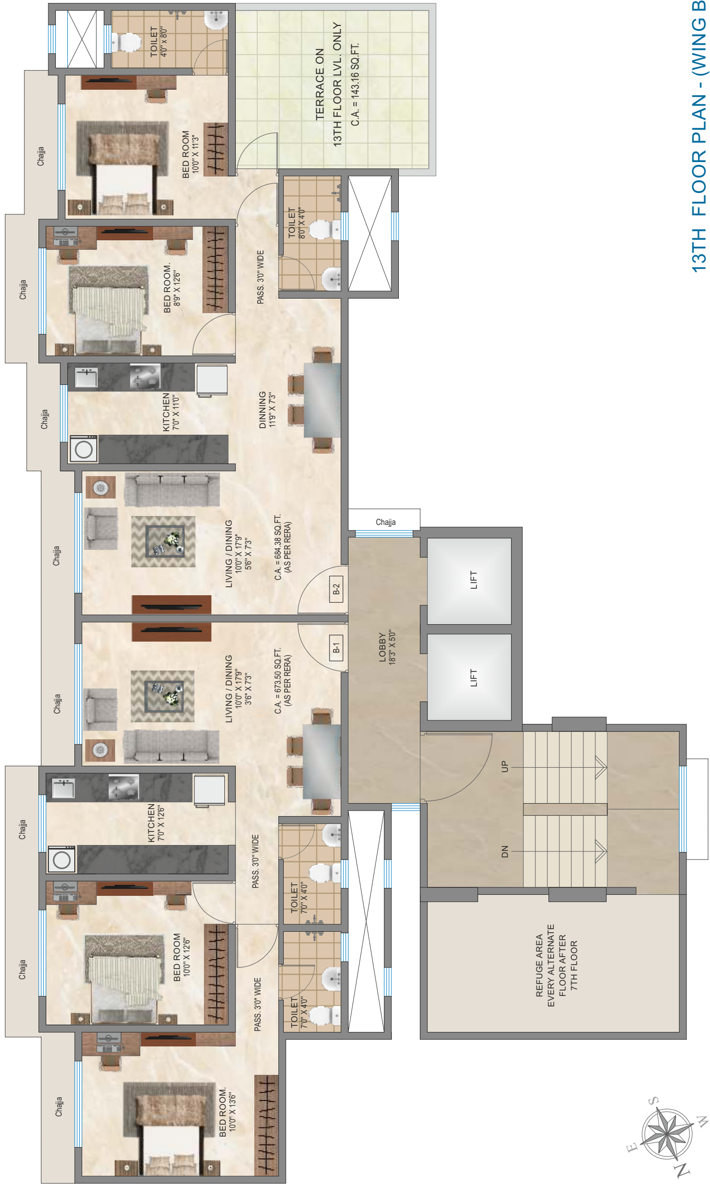
13TH FLOOR PLAN - (WING B)