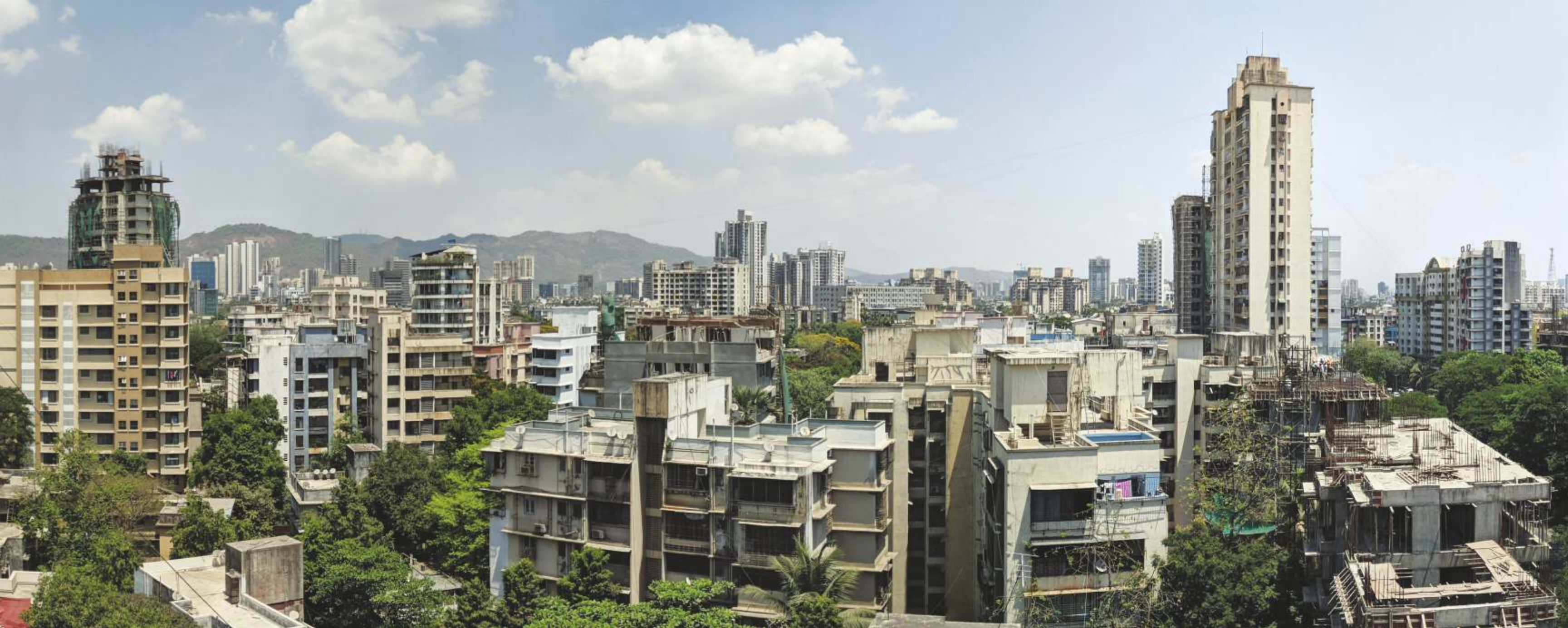
Actual photo from site