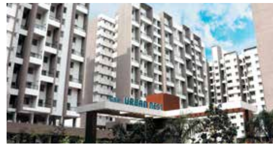
VTP URBAN NEST 1.5, 2 & 3 BEDROOM HOMES - UNDRI