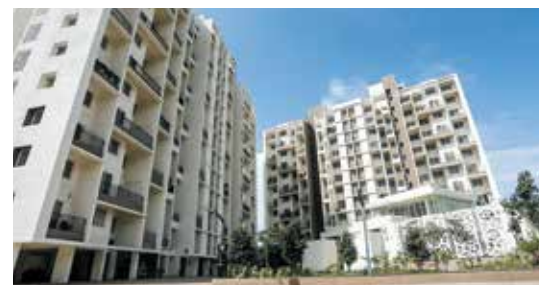
VTP URBAN RISE 1.5 & 2 BEDROOM HOMES - PISOLI