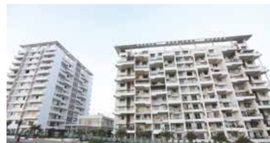
URBAN SPACE PREMIUM 3.5 & 4.5 BED RESIDENCES - NIBM