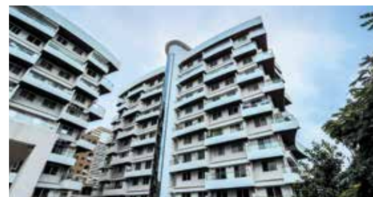
URBAN BALANCE PREMIUM 3 BED RESIDENCES - MAGARPATTA RD.