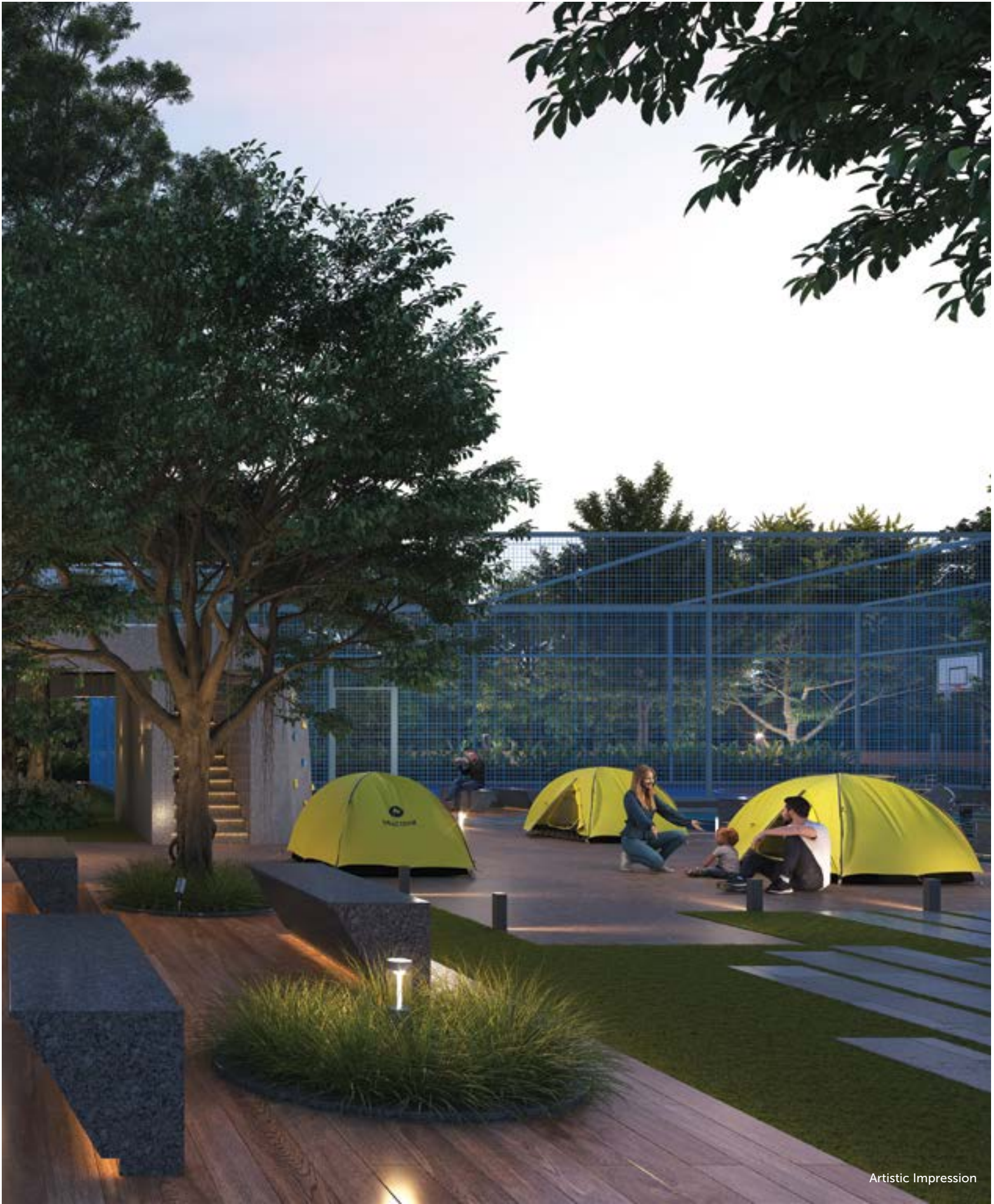
Multipurpose Play Court