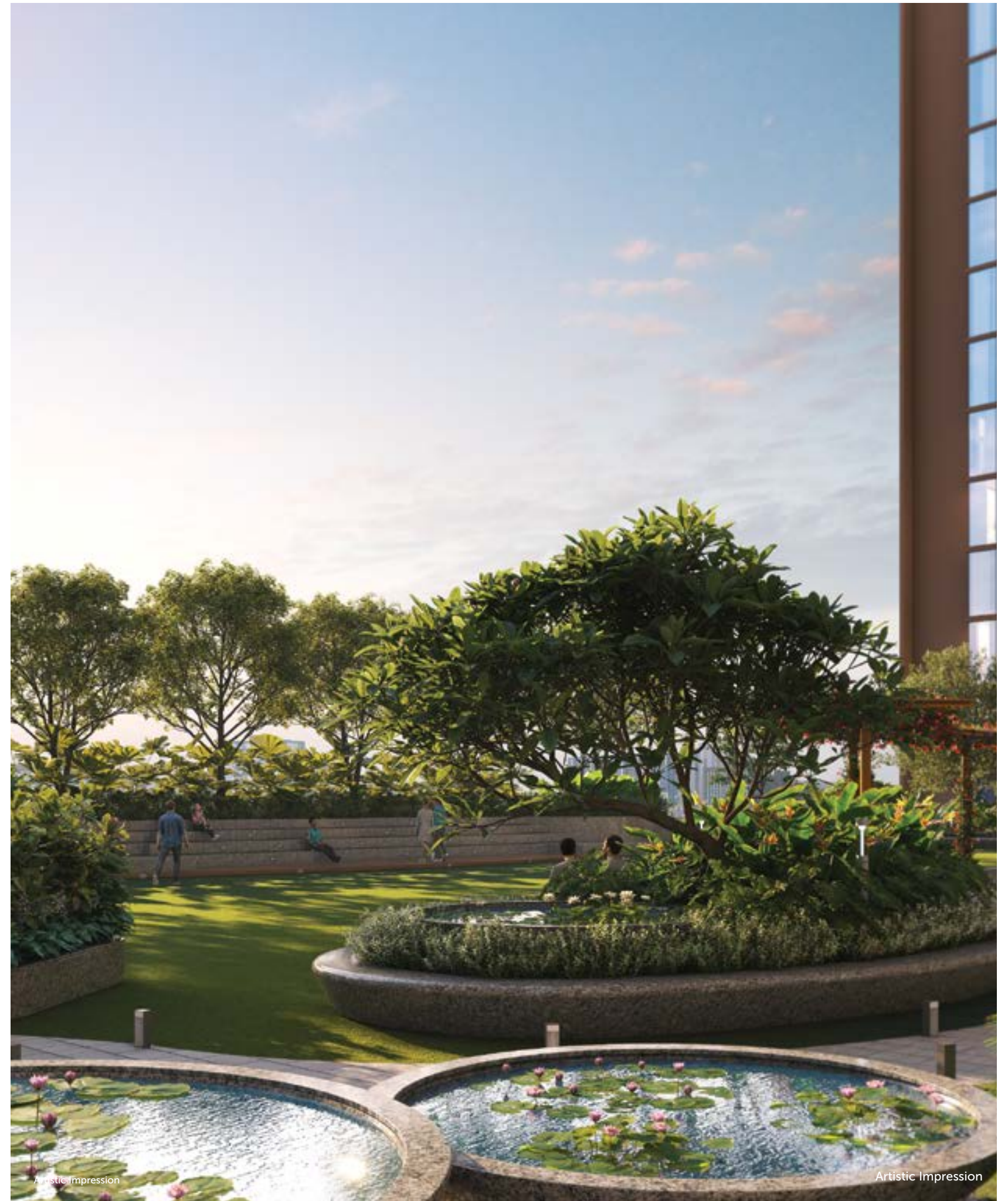
Seating Surrounding Planter