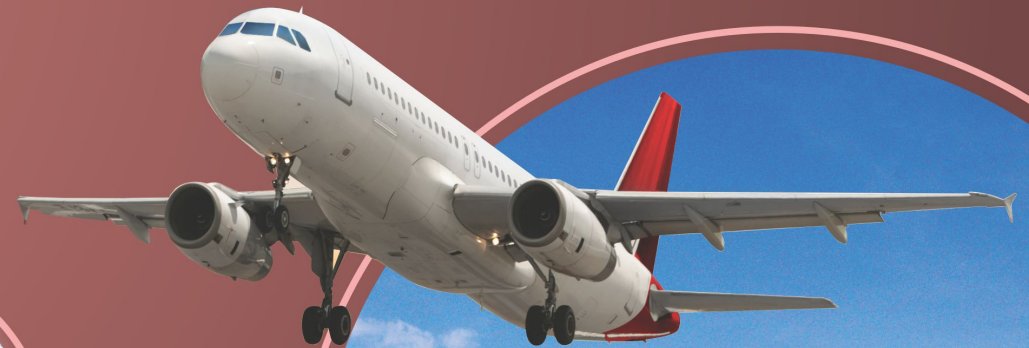
Navi Mumbai International Airport