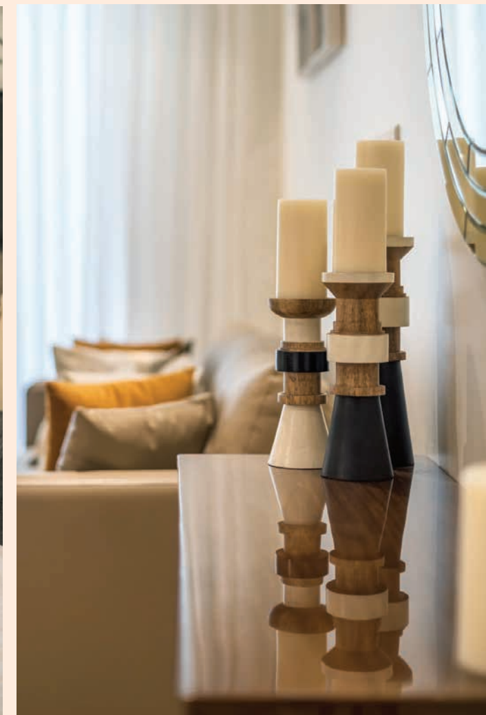
*Actual Photographs Shot On Site