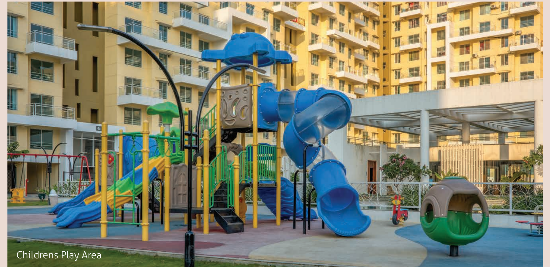
Childrens Play Area