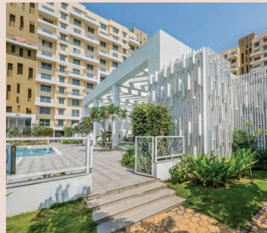
Clubhouse with Swimming Pool