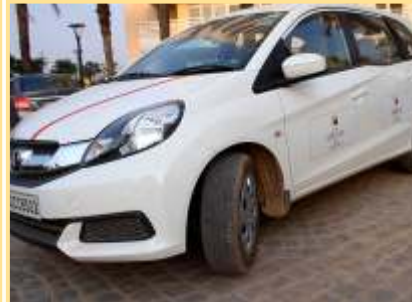
First to Start 24x7 Concierge Services