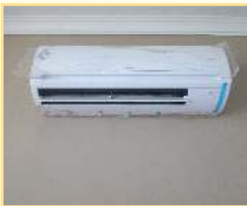
Split Air Conditioner by HITACHI