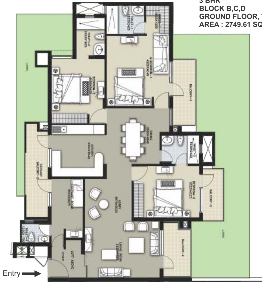
3 BHK BLOCK B,C,D GROUND FLOOR, TYPE - B AREA : 2749.61 SQ.FT