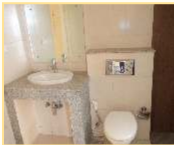
Bath & Sanitary Fittings by KOHLER