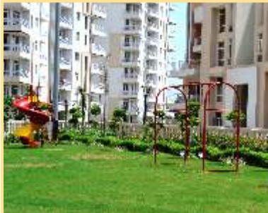
Lush Green Lawns with Kids Play Area