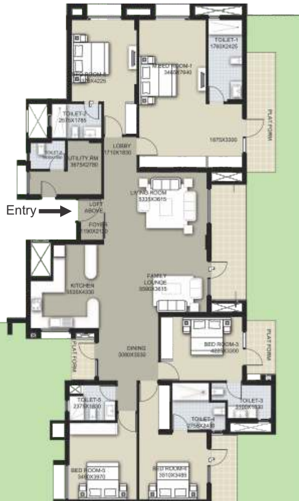
5 BHK + SERVANT BLOCK E,F,G,H GROUND FLOOR, TYPE - C AREA : 4617.52 SQ.FT