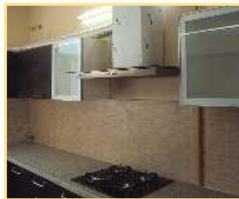
Modular Kitchen with Hob and Chimney by GLEN