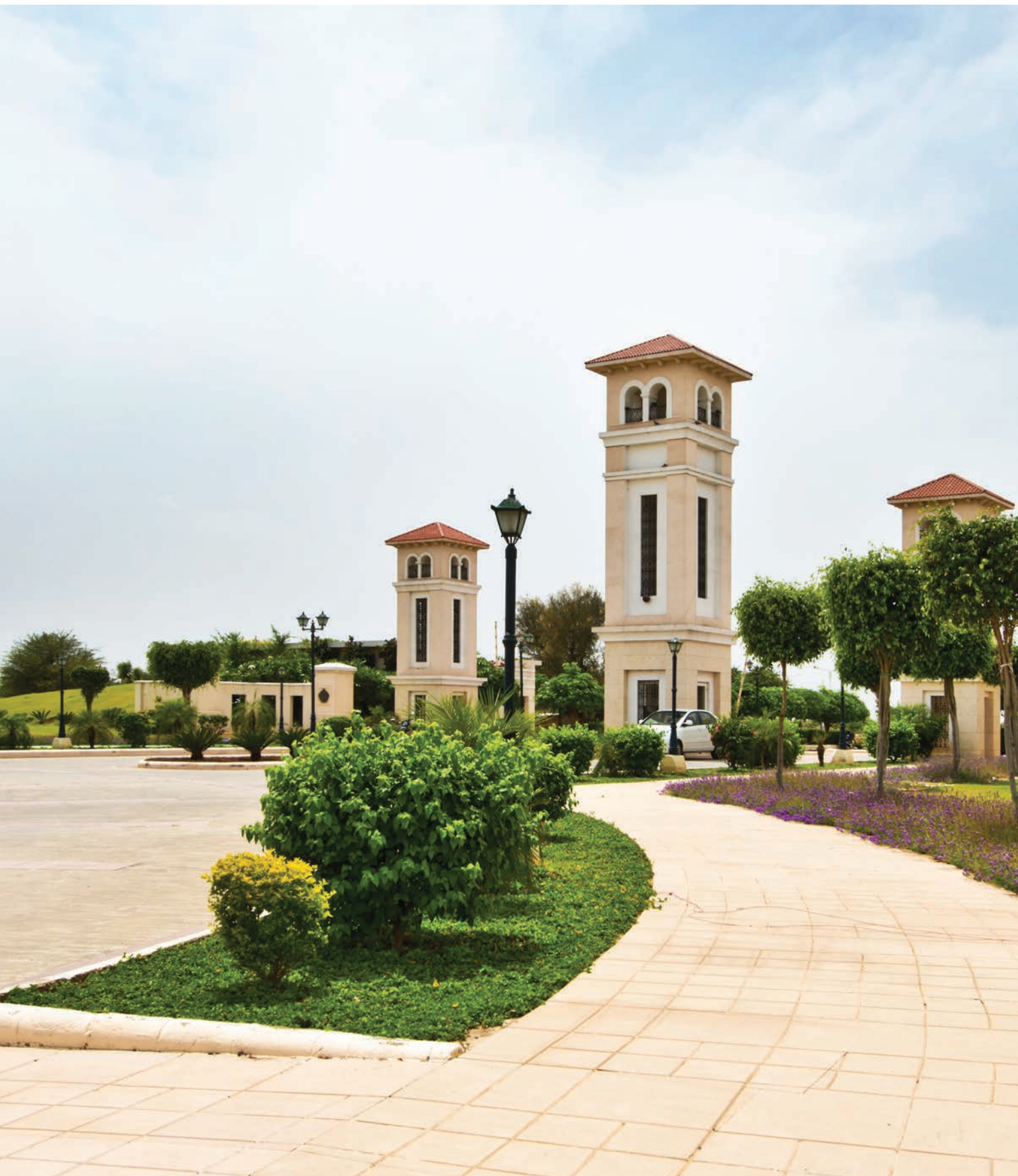
Actual Entrance Gate