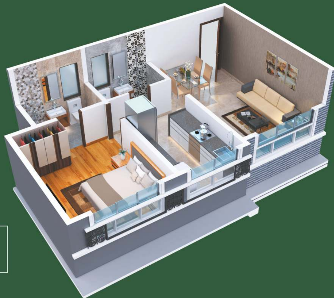
1 BHK 439 SQ.FT.