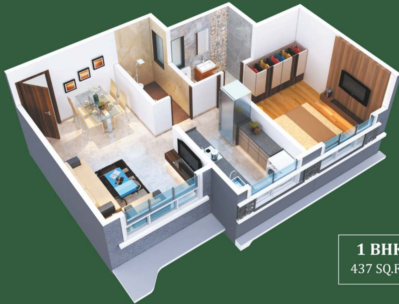
1 BHK 437 SQ.FT.