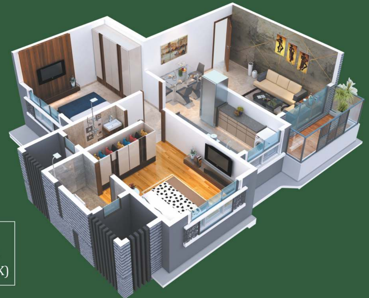
2 BHK 664 SQ.FT. (WITH DECK)