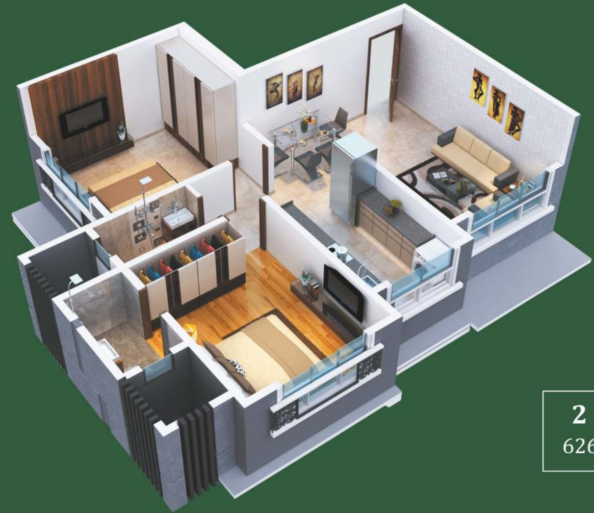
2 BHK 626 SQ.FT.