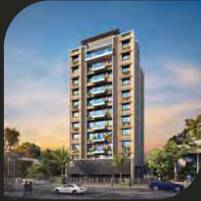
Verista Law College Road