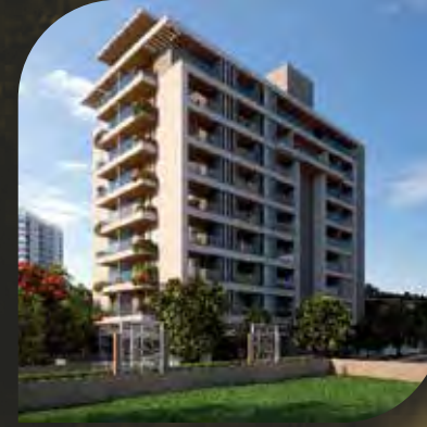
Signature Tower II Model Colony