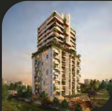
Signature Tower Model Colony