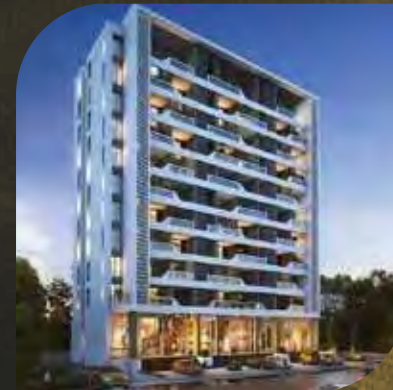
Shivalik Mayur Colony