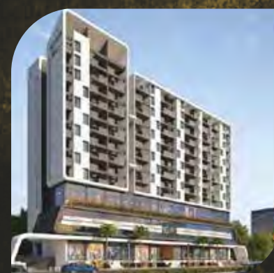
Success Square Karve Road