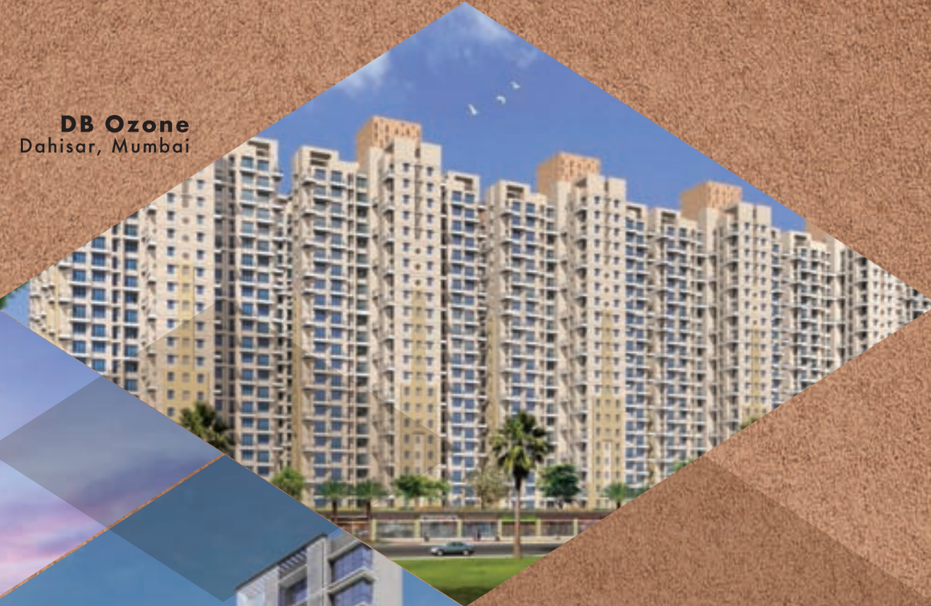
DB Ozone Dahisar, Mumbai