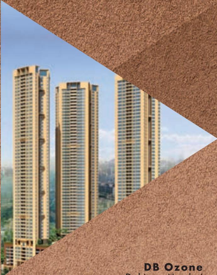
DB Ozone Dahisar, Mumbai