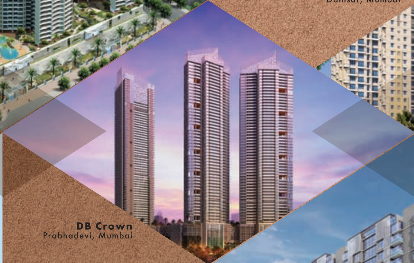
DB Crown Prabhadevi, Mumbai