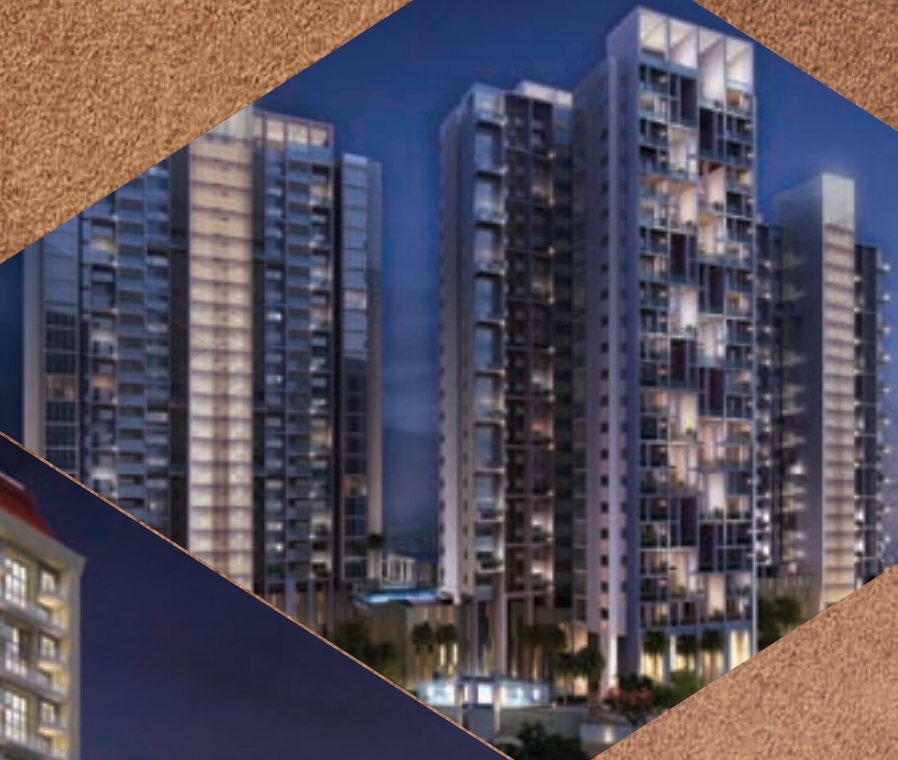
Castel Royale Grande, Bhosale Nagar Extn., Pune