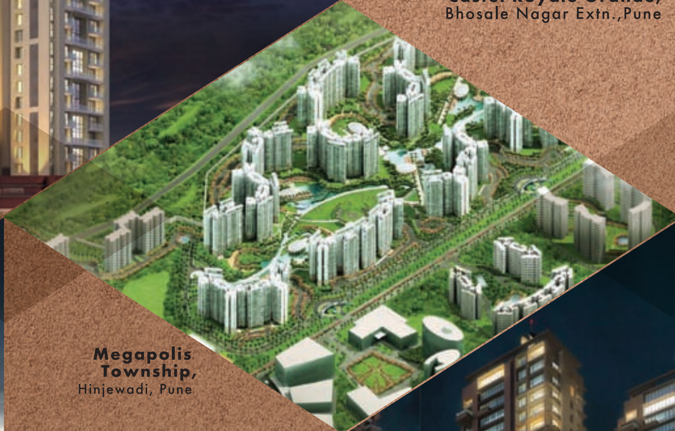
Megapolis Township, Hinjewadi, Pune