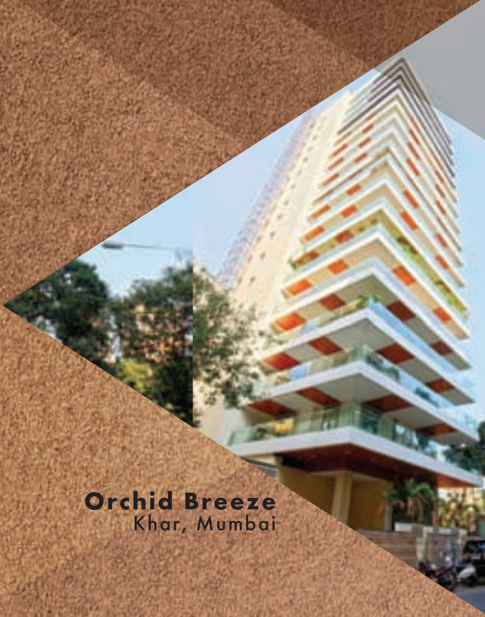
Orchid Breeze Khar, Mumbai