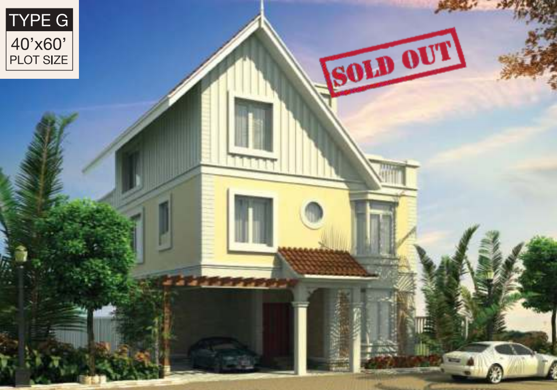
TYPE G 40'x60' PLOT SIZE