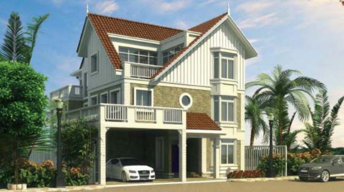
TYPE I 50'x80' PLOT SIZE