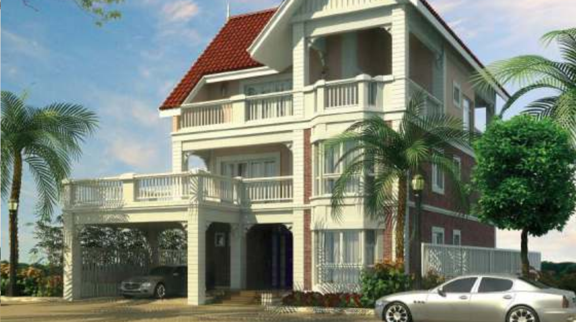
TYPE H 45'x70' PLOT SIZE