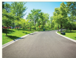
Black Top (BT) Roads