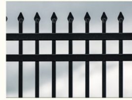
Fencing All Around the Community