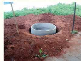
Rainwater Harvesting Pits