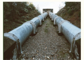
Underground Drainage System