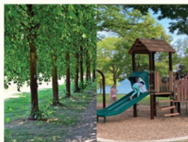
Avenue Plantation & Children's Play Area