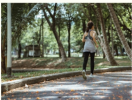
Jogging & Walking Track