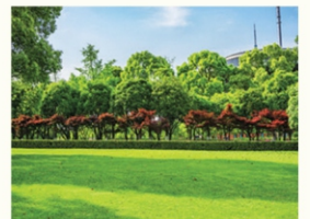
Open Lawns & Landscaped Gardens