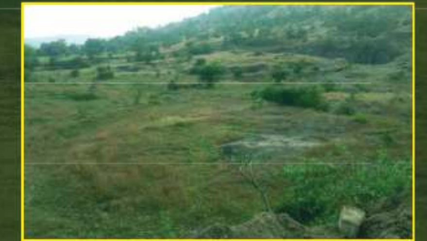
ACTUAL SITE PHOTOS