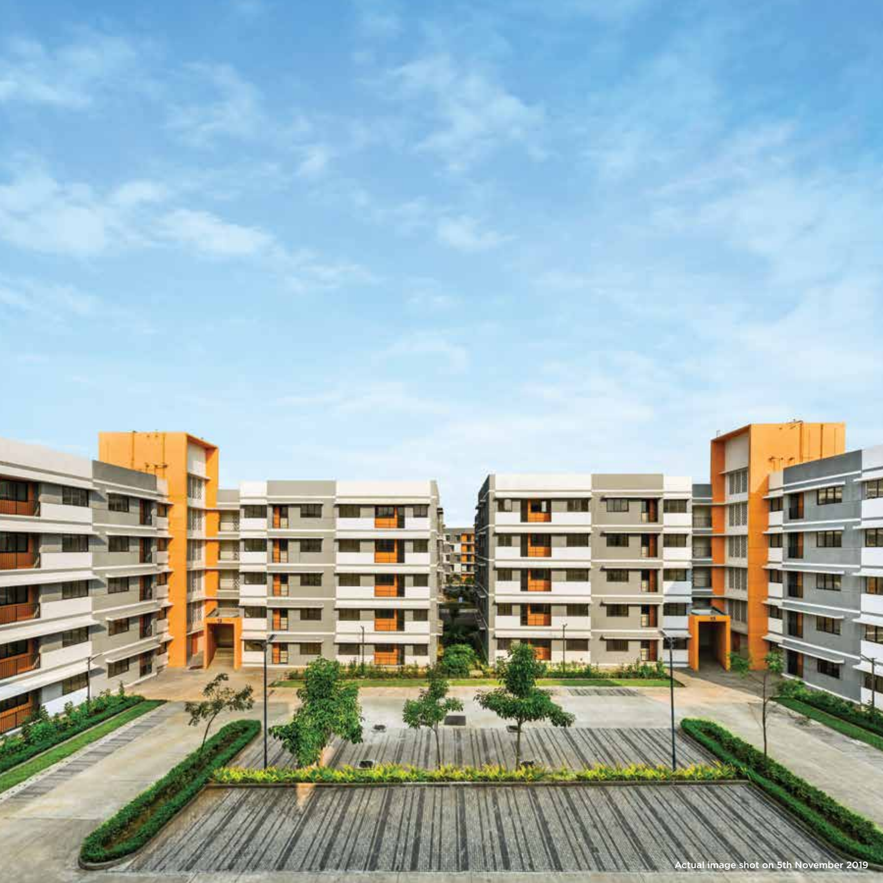
Actual image shot on 5th November 2019