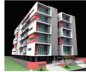
laxmi ram Residency Laxmi Nagar, Attapur