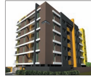
Madhavi Towers Rambagh, Attapur