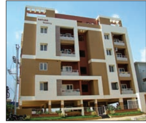
Kamala Residency Kantha Reddy Nagar, Attapur