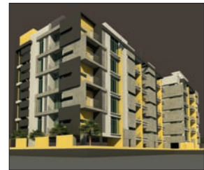
laxmi ram Trident Pillar # 125, Attapur