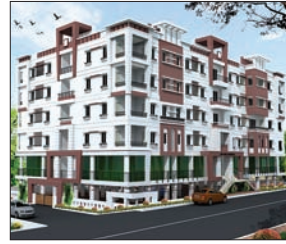
Laxmi Block Rambagh Mallaiah Towers Rambagh, Attapur