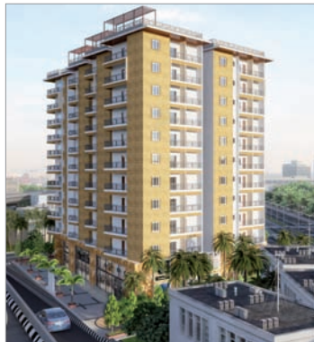
mahadev towers - 12 storied apartment pillar # 198 - pvnr express way upparpally, hyderabad