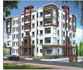
Madhavi Block Rambagh Mallaiah Towers Rambagh, Attapur