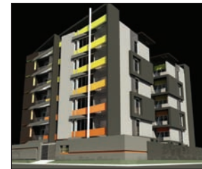
laxmi ram Splendour Hyderguda, Attapur