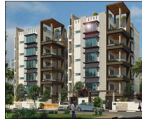
Royal Castle Radha Krishna Nagar, Attapur