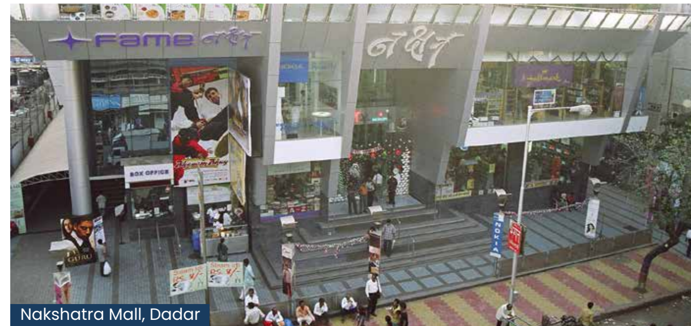
Nakshatra Mall, Dadar