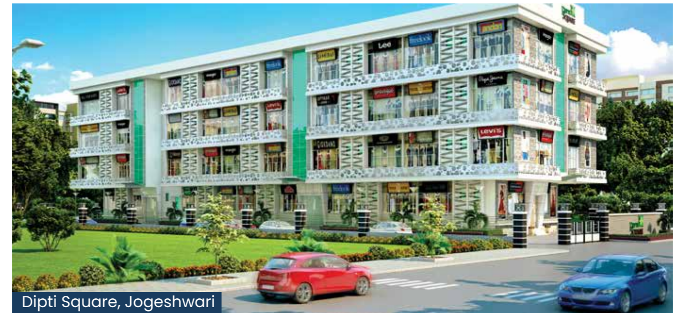
Dipti Square, Jogeshwari