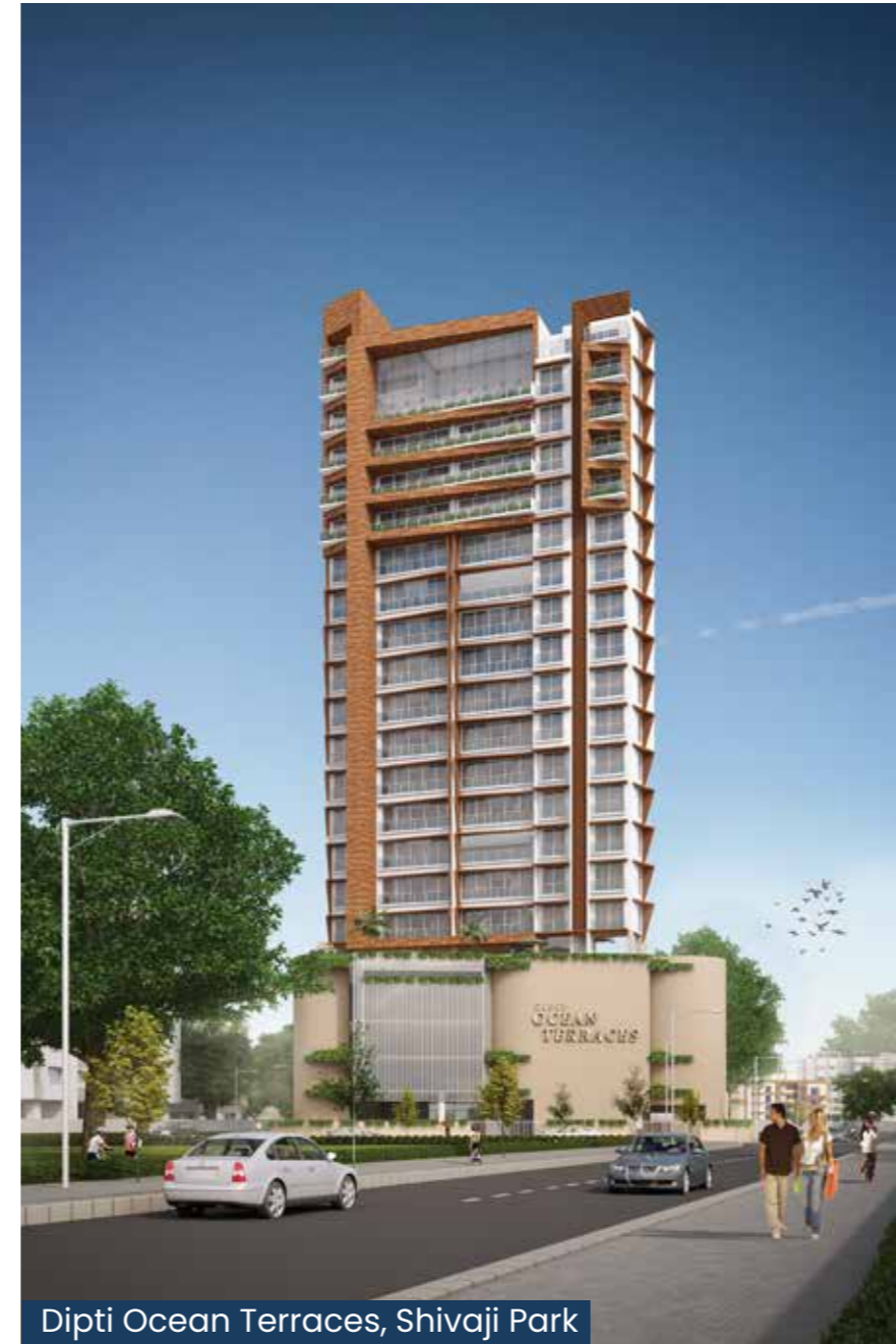
Dipti Ocean Terraces, Shivaji Park