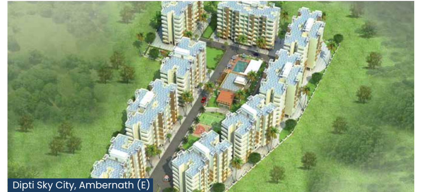
Dipti Sky City, Ambernath (E)