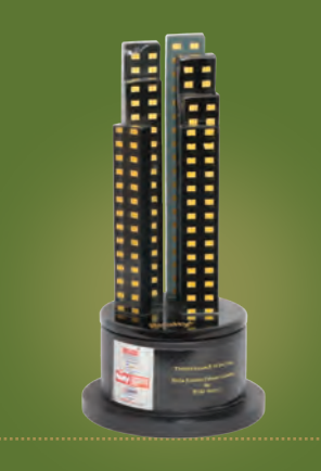
PROJECT LAUNCH OF THE YEAR:

The 11th Realty+ Excellence Awards 2019 West Zone