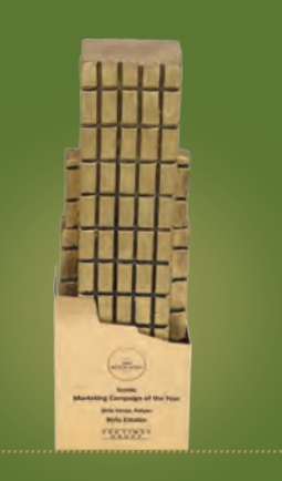
ICONIC MARKETING CAMPAIGN OF THE YEAR:

The 11th Realty+ Excellence Awards 2019 West Zone