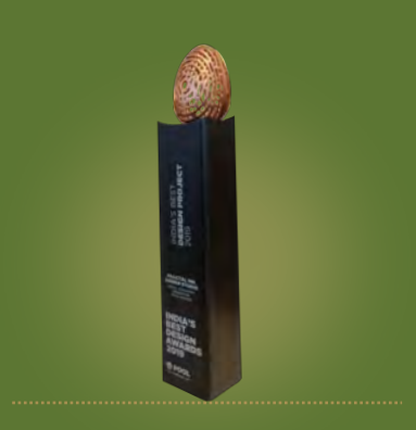
DIGITAL ECOSYSTEM DESIGN AWARD