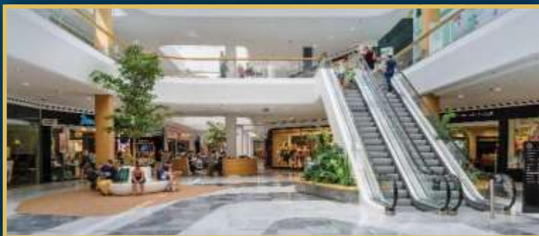
MALLS & MULTIPLEXES