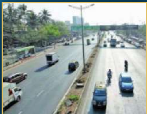
EASTERN EXPRESS HIGHWAY