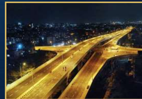
SANTACRUZ-CHEMBUR LINK ROAD