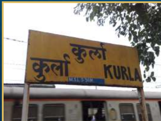
KURLA RAILWAY STATION