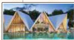
GODREJ COUNTRY ESTATE