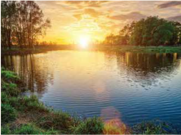
Adjacent to Reserve Forest and Lake