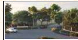
GODREJ ORCHARD ESTATE