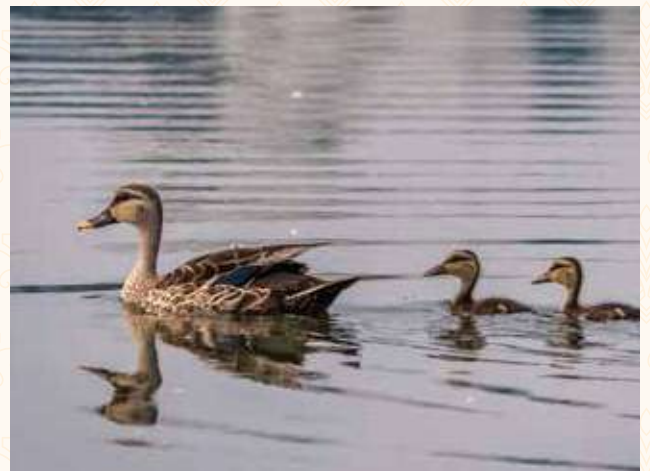
Adjacent to a Serene Pond