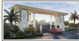
GODREJ GREEN ESTATE