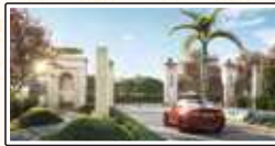
GODREJ PARKLAND ESTATE