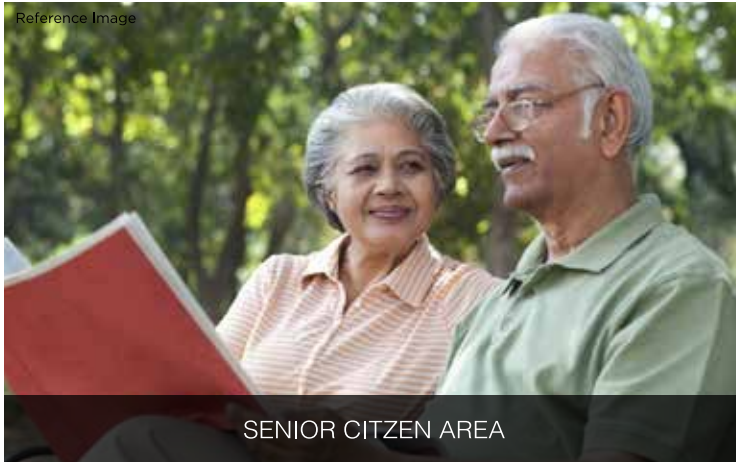
SENIOR CITIZEN AREA