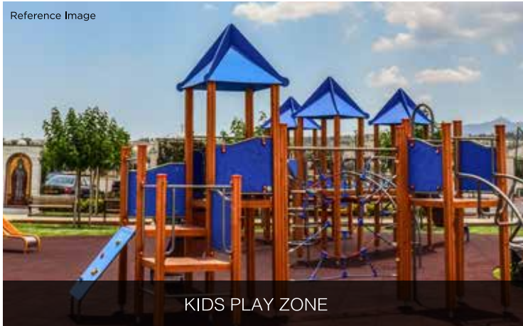
KIDS PLAY ZONE