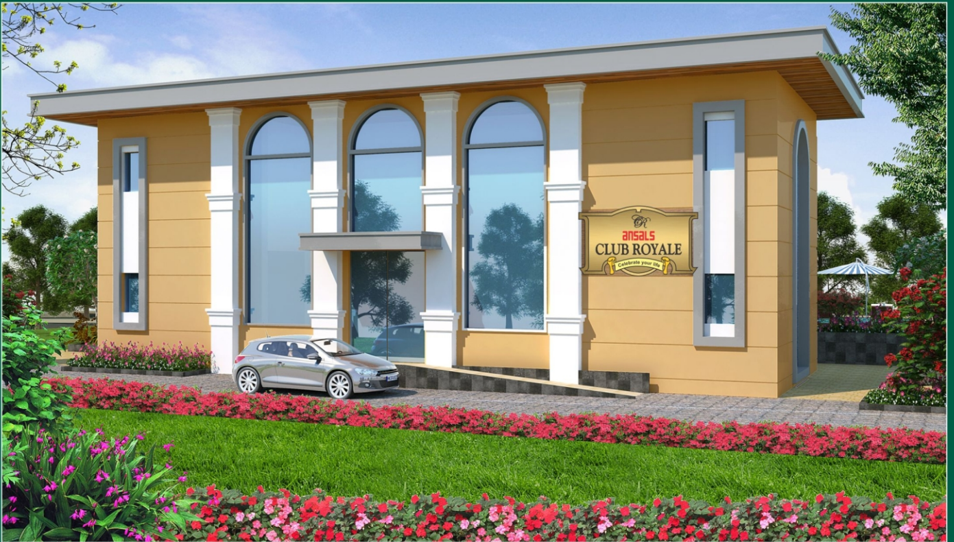
Perspective View Of Club House