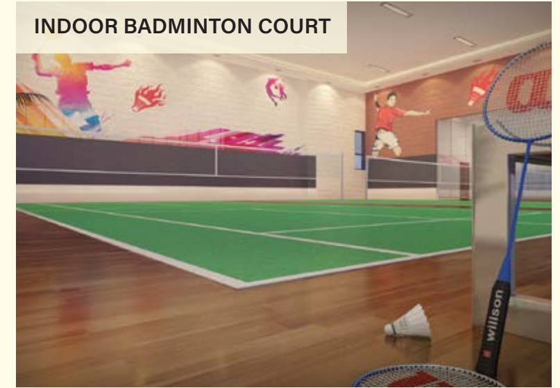
INDOOR BADMINTON COURT